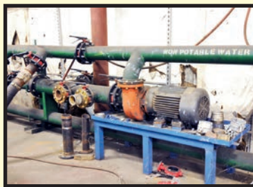
LINEAR MANIFOLD HYDROSTATIC TANK TESTING SYSTEM