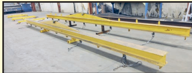
SPREADER BARS AND LIFTING FIXTURES