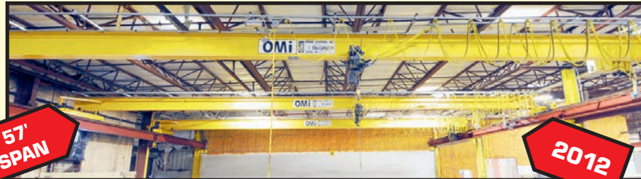
VIEW OF OMI 3 T. AND 1 T. OVERHEAD BRIDGE CRANES