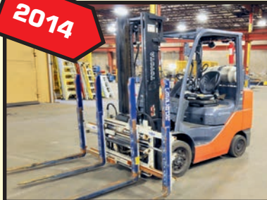
TOYOTA 6,000-LB. LPG FORKLIFT W/CASCADE FORK UNIT