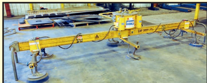
ANVER 3,000-LB. VACUUM LIFT