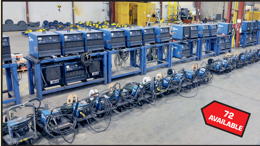
MILLER DELTAWELD 302 MIG WELDING MACHINE