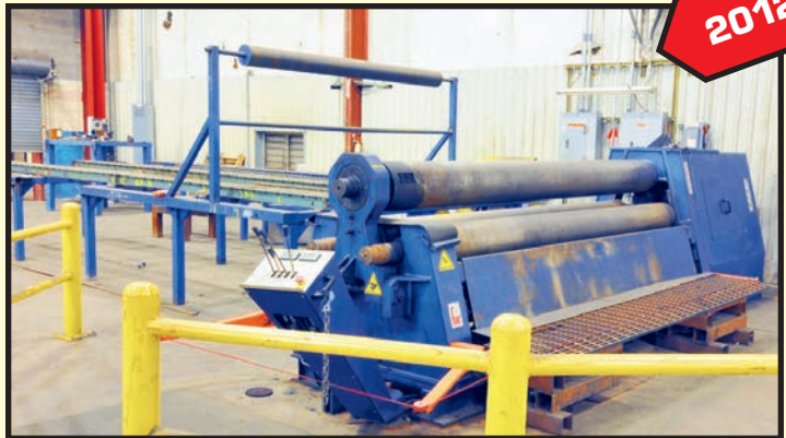
FACCIN 10' X 5/8" DOUBLE PINCH PLATE BENDING ROLL