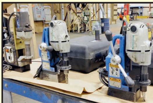
HOUGEN MAGNETIC BASE DRILLS