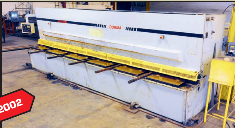
DURMA 20' X 1/4" HYDRAULIC SHEAR