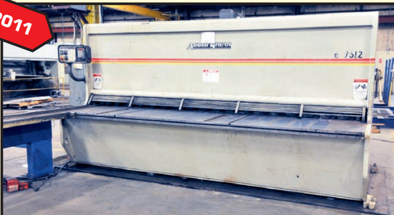
ACCURSHEAR 12' X 3/8" HYDRAULIC SHEAR