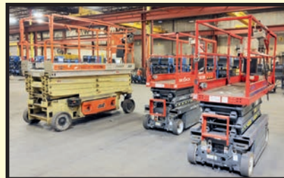
VIEW OF SCISSOR LIFTS