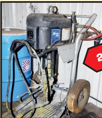
GRACO XTREME X70 AIRLESS SPRAYER

SCHMIDT MDL. 3.5 CU. FT. , new 2000, S/N L6836; CLEMCO 600-LB. CAP. MDL. 2443 , S/N 9014.