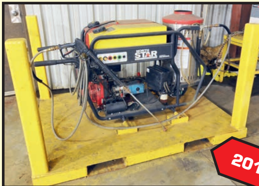
NORTHSTAR HEATED PRESSURE WASHER