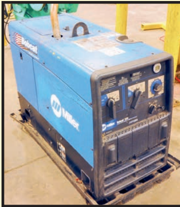
MILLER BOBCAT 225 WELDER GENERATOR