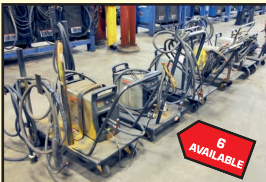
HYPERTHERM PORTABLE PLASMA CUTTING SYSTEMS

(2) PANDJIRIS 26' X 14' , spider base w/extensions, new motors and controls, never assembled since rebuild.