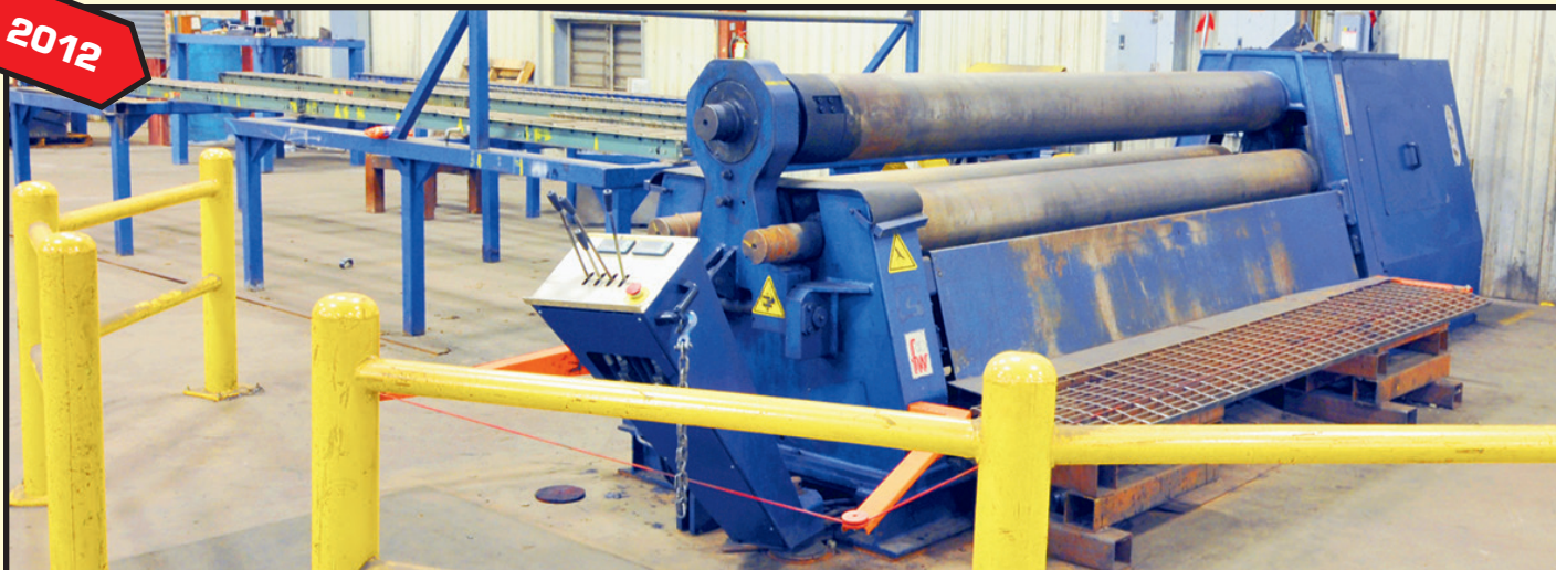
FACCIN 10' X 5/8" DOUBLE PINCH PLATE BENDING ROLL