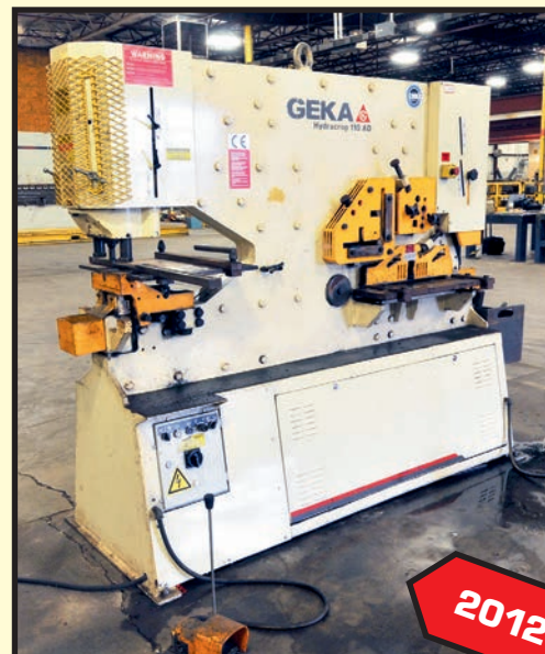
GEKA 110 T. CAP. HYDRAULIC IRONWORKER