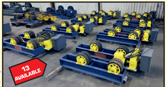
VIEW OF WEBB PWR. TURNING ROLL SETS