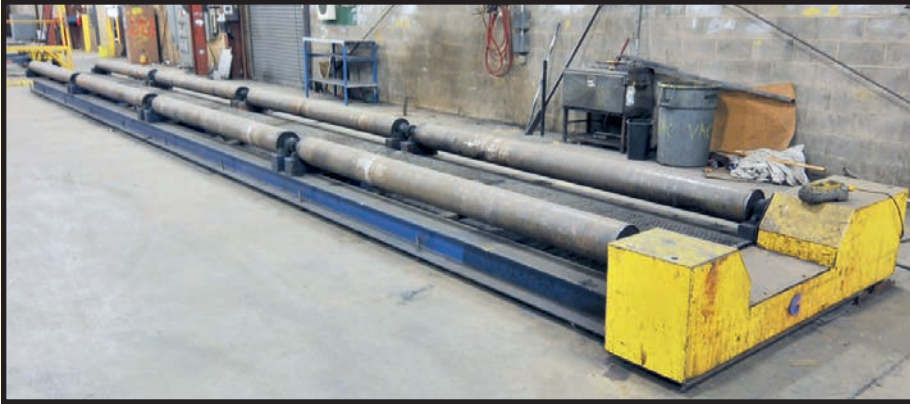
CUSTOM 44' POWERED FIT-UP ROLL

Wearing Masks & Social Distancing Will Be Required