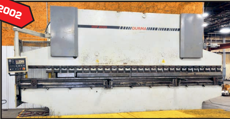
DURMA 300 T. X 236" CNC HYDRAULIC PRESS BRAKE