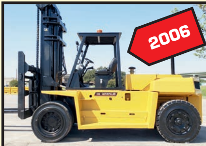
CATERPILLAR 33,000-LB. BASE CAP. FORKLIFT