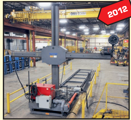
PRESTON EASTIN 1212HD SUBARC WELDING MANIPULATOR