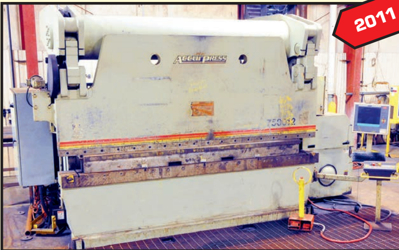
ACCURPRESS 500 T. X 12' CNC HYDRAULIC PRESS BRAKE