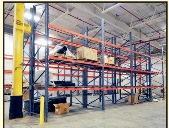
SAMPLE VIEW OF PALLET RACK