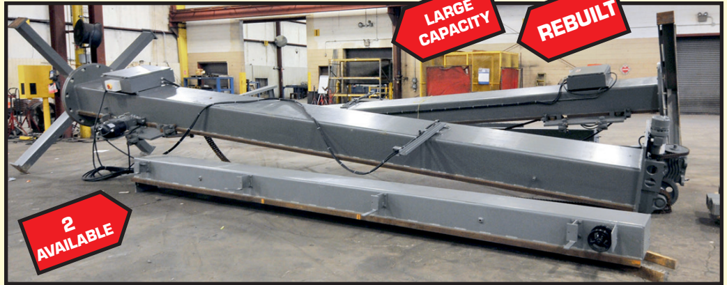
PANDJIRIS 26' X 14' WELDING MANIPULATOR