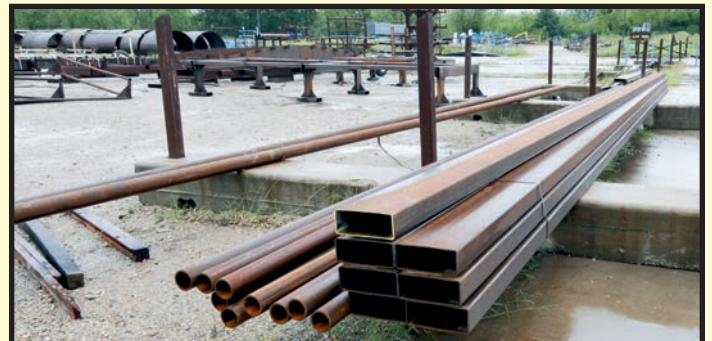
WIDE ASSORTMENT OF RAW MATERIALS