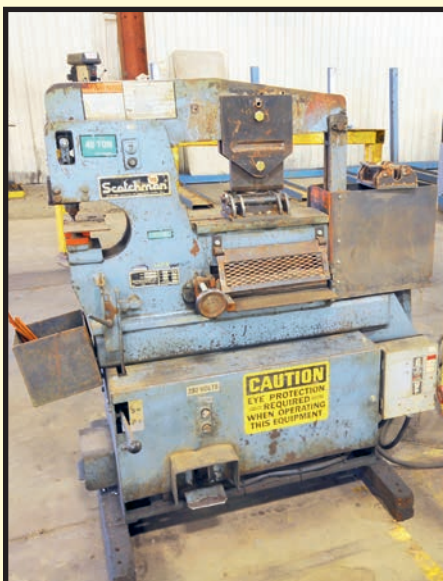
SCOTCHMAN 40 T. CAP. HYDRAULIC IRONWORKER