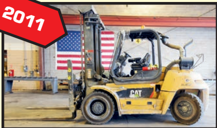
CATERPILLAR 20,000-LB. DIESEL FORKLIFT