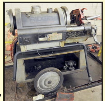
RIDGID MDL. 1224, 4" PIPE THREADER