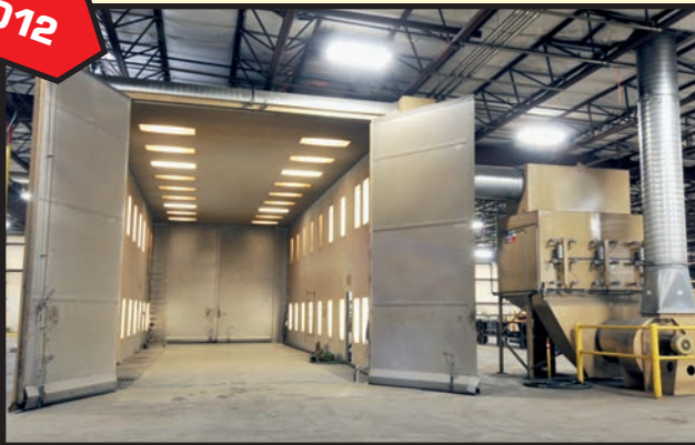
ABRASIVE BLAST SYSTEM BLAST BOOTH