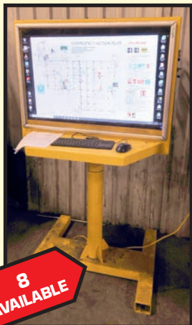
SCEPTRE 42" SHOP FLOOR COMPUTER CONSOLES