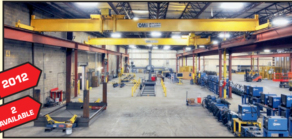
(1 OF 2) OMI 5 T. X 47' FREE STANDING CRANE SYSTEMS W/(2) BRIDGE CRANES PER SYSTEM