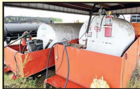
GASOLINE AND DIESEL TANKS