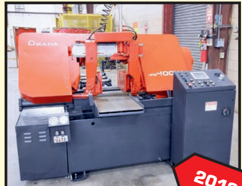
AMADA MDL. HFA-400W CNC HORIZONTAL BANDSAW