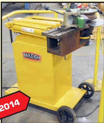
BAILEIGH HYDRAULIC PIPE BENDER