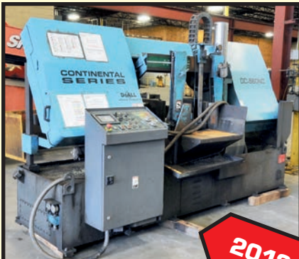
DOALL MDL. DC-560NC CNC HORIZONTAL BANDSAW