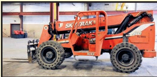
JLG MDL. 8942 SKYTRAK TELEHANDLER