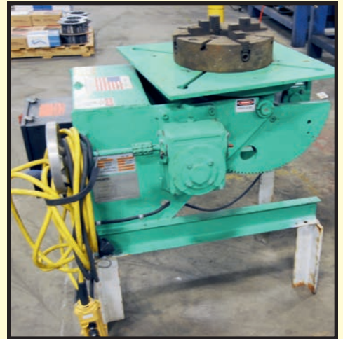
PANDJIRIS 1,500-LB. CAP. WELDING POSITIONER