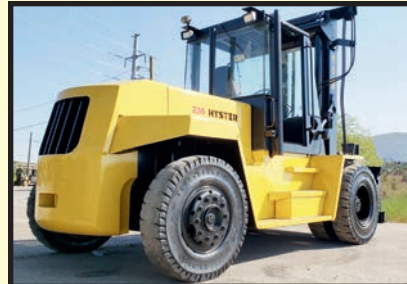
HYSTER 23,000-LB. BASE CAP. FORKLIFT