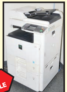
ECOSYS DOCUMENT CENTER