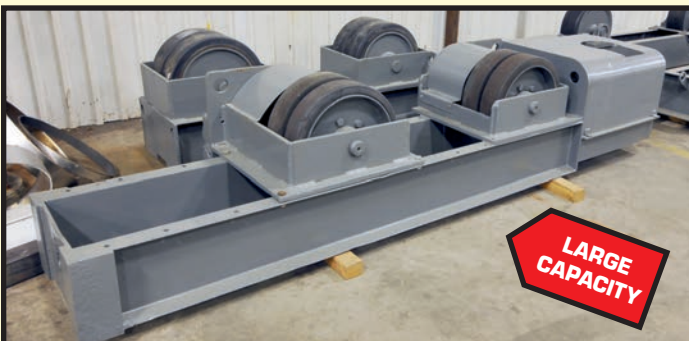
100,000-LB. CAP. PANDJIRIS PWR. TURNING ROLL SET