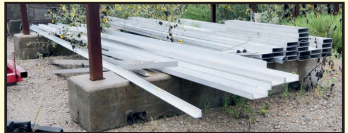
ALUMINUM SHAPES AND TUBES