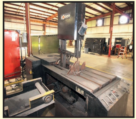
SV-510DM TILT FRAME VERTICAL BANDSAW