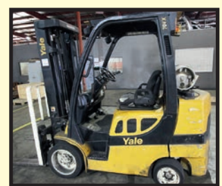
YALE 7,000-LB. BASE CAP. LPG FORKLIFT