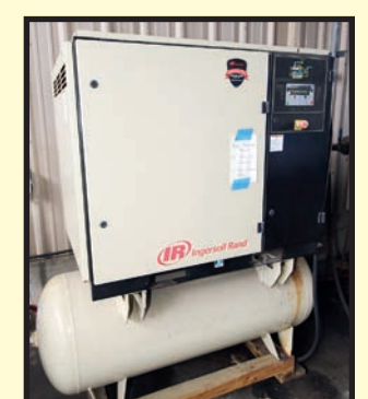
INGERSOLL RAND 30 HP AIR COMPRESSOR