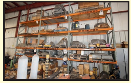
RACKS FULL OF NEW, REBUILT AND USED REPLACEMENT PARTS