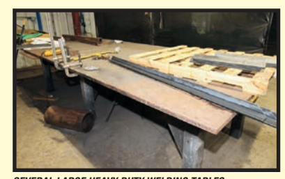
SEVERAL LARGE HEAVY DUTY WELDING TABLES