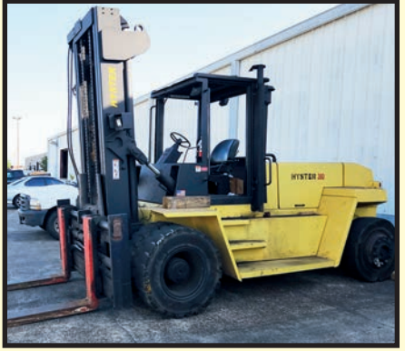
HYSTER H360XI 36.000-LB. BASE CAP