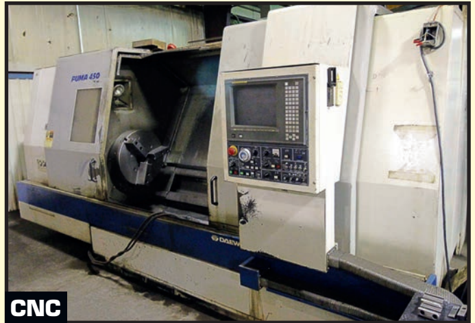
CNC DAEWOO PUMA MDL. 450 CNC LATHE