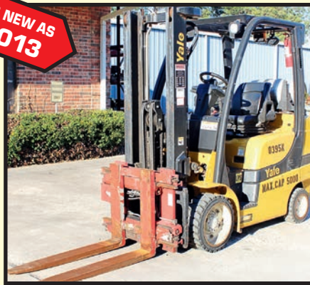
(1 OF 3) YALE LPG FORKLIFTS