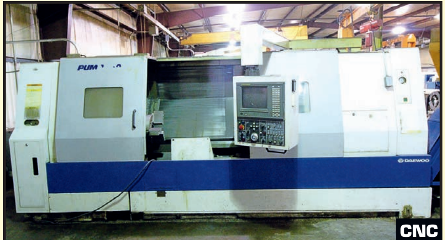
CNC DAEWOO PUMA MDL. 350LB CNC LATHE

FEMCO MDL. WNCL35/1100 , new 1995, Fanuc O-T CNC control, 19" swing over cross slide, 40" btwn. centers, Rota TB500-230 pwr. chuck, 12-pos. turret, S/N L31011.