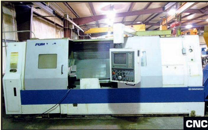
DAEWOO PUMA MDL. 350LB CNC LATHE

Featuring: (13) CNC Lathes, (2) Vertical Machining Centers, Manual Machine Tools, Fabricating Equipment, (4) Bandsaws, Precision Machine Accessories, Material Handling Equipment, Rolling Stock & Much More!