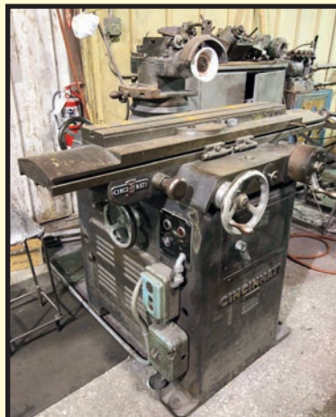
CINCINNATI NO. 2 TOOL AND CUTTER GRINDER