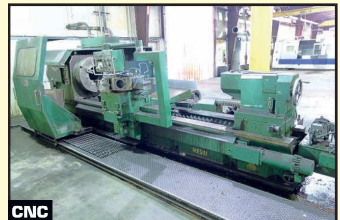
CNC IKEGAI MDL. ANC56B CNC FLATBED HOLLOW SPINDLE LATHE