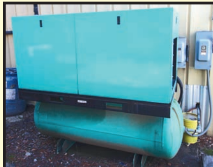
SULLIVAN PALATEK MDL. D40 ROTARY SCREW AIR COMPRESSOR