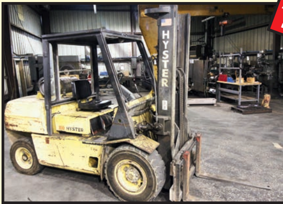
HYSTER MDL. H100XL FORKLIFT