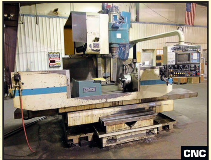
FEMCO MDL. VMC1400 4-AXIS CNC VERTICAL MACHINING CENTER