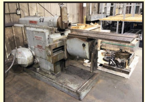
JEMCO 24" UNIVERSAL SHAPER