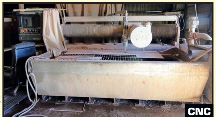
OMAX MDL. 55100 WATERJET CUTTING SYSTEM