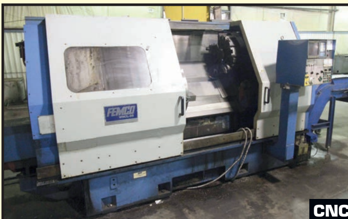
CNC FEMCO MDL. WNCL35/1100 CNC LATHE