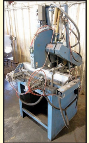
CTD MACHINES MDL. M516 CARBIDE ABRASIVE CUT-OFF SAW