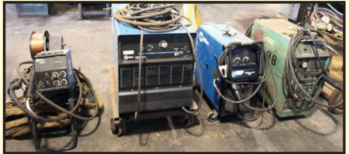
SAMPLE VIEW OF WELDERS

MILLER DELTAWELD 452, new 2014, S/N ME410119C, w/60 series Miller wire feeder, S/N KJ056683; MILLERMATIC 252, new 2016, S/N MG200093N; L-TEC MIGMASTER 250.