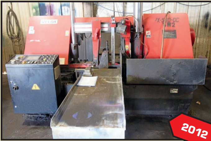
VELOX MDL. VX-530-DC AUTOMATIC HORIZONTAL BANDSAW