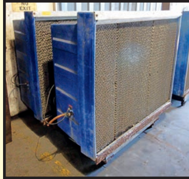
QUIETCOOL EVAPORATIVE COOLERS