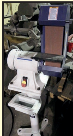
RPM 4" BELT GRINDER