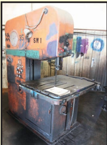
DOALL MDL. 26-3 VERTICAL BANDSAW

MODIFIED FROM SEA CONTAINER, exhaust system.