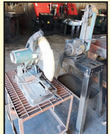
CHOPSAW AND BELT GRINDER