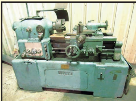
RIVETT 12" X 20" TOOL MAKERS LATHE