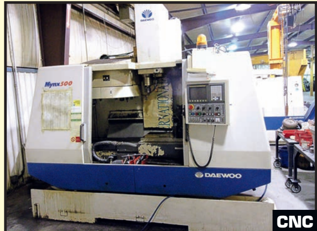
DAEWOO MYNX MDL. 500 4-AXIS CNC VERTICAL MACHINING CENTER