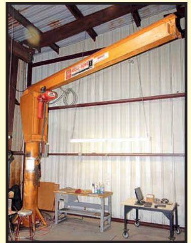
ABELL-HOWE 1 T. CAP. PEDESTAL JIB CRANE