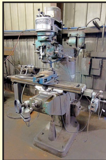
BRIDGEPORT J-HEAD VERTICAL TURRET MILL