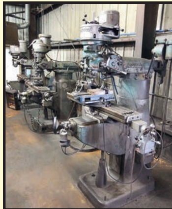
SAMPLE VIEW OF MILLING MACHINES