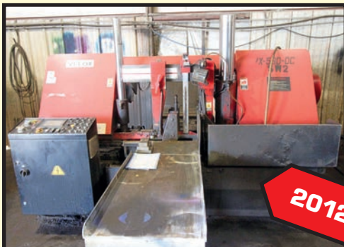
VELOX MDL. VX-530-DC AUTOMATIC HORIZONTAL BANDSAW