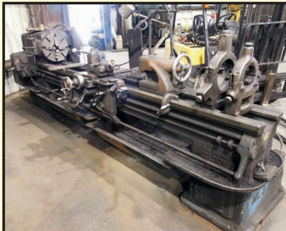
AMERICAN PACEMAKER 16" X 102" ENGINE LATHE

INSPECTION: Tuesday, March 23, 9:00 A.M. to 4:00 P.M. Wearing Masks and Social Distancing will be required.