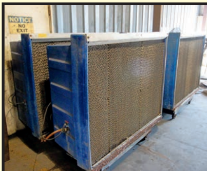
QUIETCOOL EVAPORATIVE COOLERS