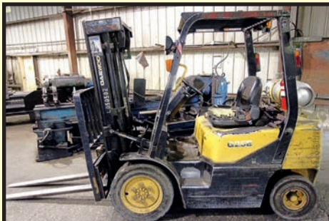
DOOSAN 5,000-LB. BASE CAP. FORKLIFT