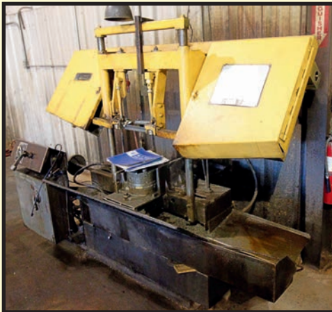
W.F. WELLS MDL. F15 HORIZONTAL BANDSAW