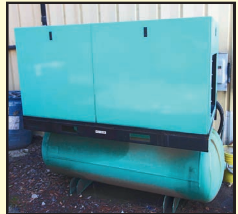
SULLIVAN PALATEK MDL. D40 ROTARY SCREW AIR COMPRESSOR