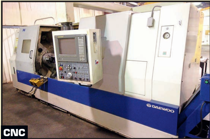
CNC DAEWOO PUMA MDL. 350LB CNC LATHE