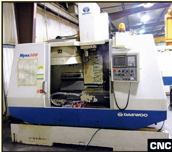
DAEWOO MYNX MDL. 500 4-AXIS CNC VERTICAL MACHINING CENTER