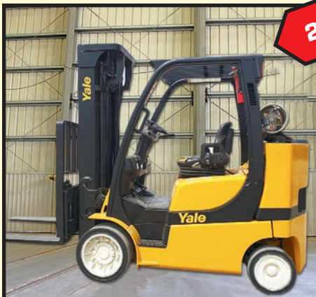
YALE 8,000-LB. BASE CAP. FORKLIFT

REAL ESTATE TO BE AUCTIONED ON WEDNESDAY, DECEMBER 8 (See Back Page)