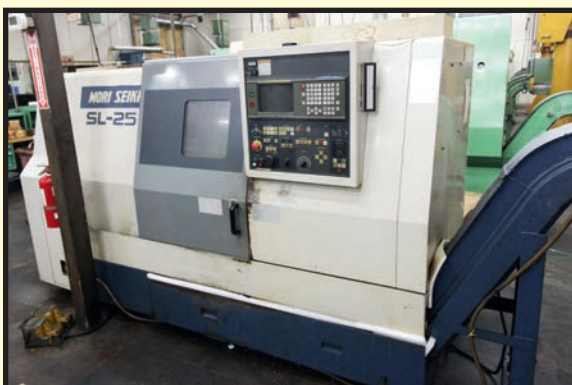
MORI SEIKI MDL. SL-25B/500 CNC LATHE