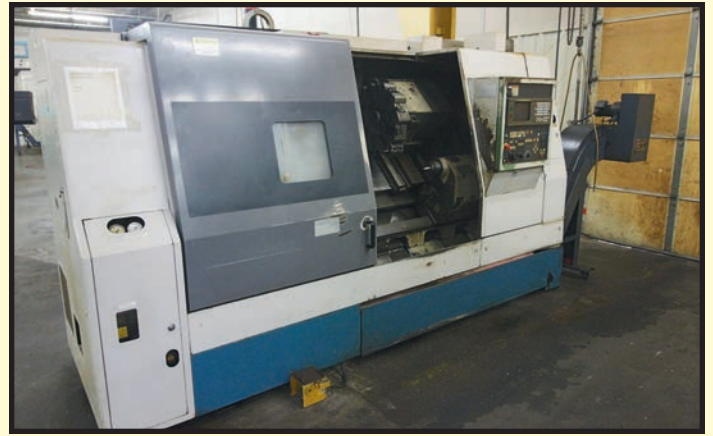
(1 OF 2) MORI SEIKI MDL. SL-35B/750 CNC LATHES