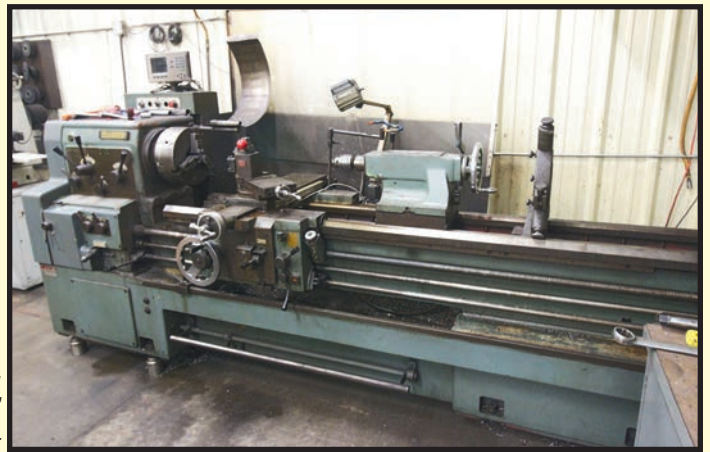
WHACHEON 20-1/2" X 80" GAP BED LATHE