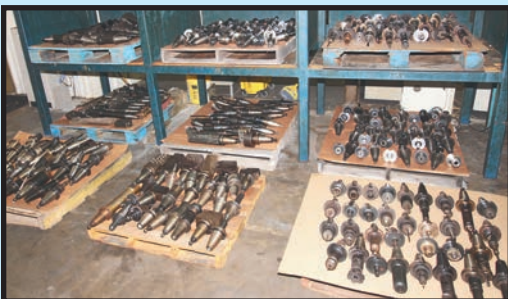
VIEW OF TOOLING