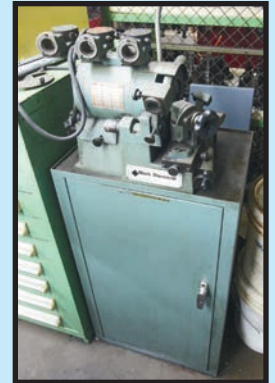
DAREX MDL. SP2500 SUPER PRECISION DRILL SHARPENER