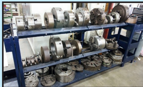
VIEW OF WORKHOLDING

REAL ESTATE TO BE AUCTIONED ON WEDNESDAY, DECEMBER 8