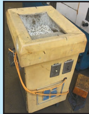
BURR KING DEBURRING MACHINE