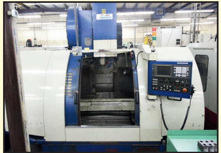
JOHNFORD MDL. SV-45H CNC VERTICAL MACHINING CENTER

JOHNFORD MDL. SV-45H , Fanuc Series 18M CNC control, 20" x 48" t.b.l., 45"X, 20.9"Y, 24.8" Z-axis travels, 50 taper, wired for 4th axis, 24-pos. ATC, S/N VN0303.