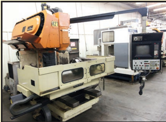
(1 OF 2) LEBLOND MAKINO MDL. FNC106 CNC VERTICAL MACHINING CENTERS

TSUDAKOMA, WIDE SELECTION OF LARGE CAPACITY TO MEDIUM CAPACITY AVAILABLE. SEE CATALOG FOR DETAILS.