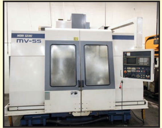
(1 OF 3) MORI SEIKI MDL. MV-55/50 CNC VERTICAL MACHINING CENTERS