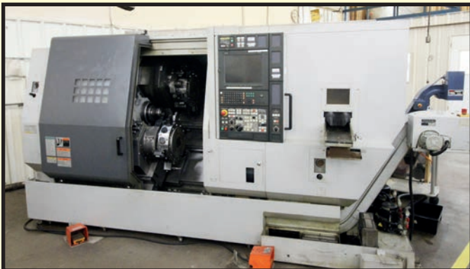
MORI SEIKI MDL. NL-ZT1500YB CNC MULTI-AXIS LATHE

Featuring: Mori Seiki, Kuraki, Okuma, Mitsubishi, Sodick & Other CNC Machine Tools & EDM Machines; Huge Quantity of Tooling & Accessories, PLUS REAL ESTATE TO BE AUCTIONED ON WEDNESDAY, DECEMBER 8