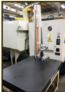
BROWN & SHARPE MDL. MICRO-HITE 900 DIGITAL HEIGHT GAUGE

AIR FLOW SYSTEMS, INC.; TORIT DONALDSON.