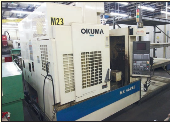
OKUMA MDL. MX-45VAE CNC VERTICAL MACHINING CENTER