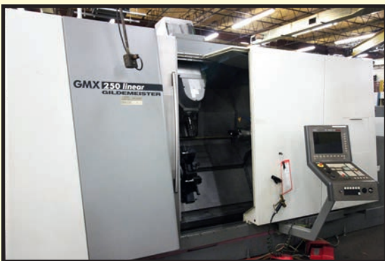
GILDEMEISTER MDL. GMX250 LINEAR CNC MULTI-AXIS LATHE

Timed Online Only WEDNESDAY, DECEMBER 8 & THURSDAY, DECEMBER 9 BIDS START CLOSING 10:00 A.M.