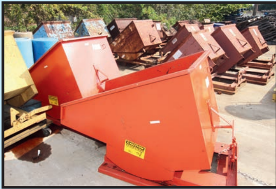
VIEW OF DUMP HOPPERS