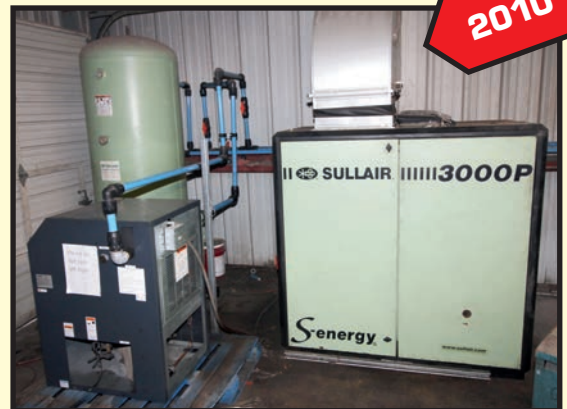
SULLAIR MDL. 3000P/A ROTARY SCREW AIR COMPRESSOR