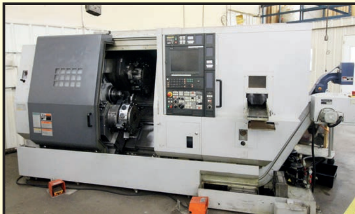
MORI SEIKI MDL. NL-ZT1500YB CNC MULTI-AXIS LATHE