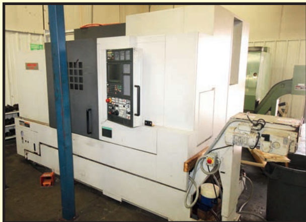
MORI SEIKI MDL. NL-3000/700 CNC MULTI-AXIS LATHE