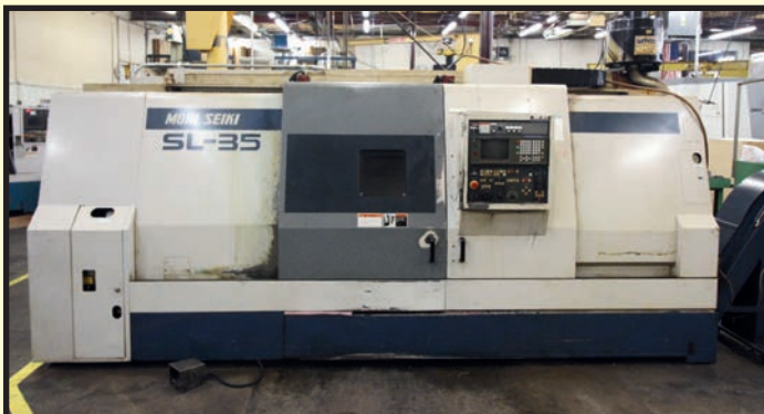
(1 OF 8) MORI SEIKI MDL. SL-35B CNC LATHES

(2) MORI SEIKI MDL. TL-40B/3000 , MSC-518 CNC control, 24" swing, 122" btwn. centers, 12-pos. turret, tailstock, 12" 3-jaw chuck, chip conveyor, S/N 2197, S/N 2076 w/Moric-TF CNC control.