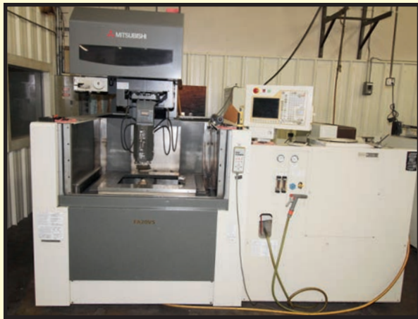
MITSUBISHI MDL. FA20VSM WIRE EDM