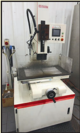
MITSUBISHI MDL. EDM2500M PLUNGE TYPE EDM MACHINE