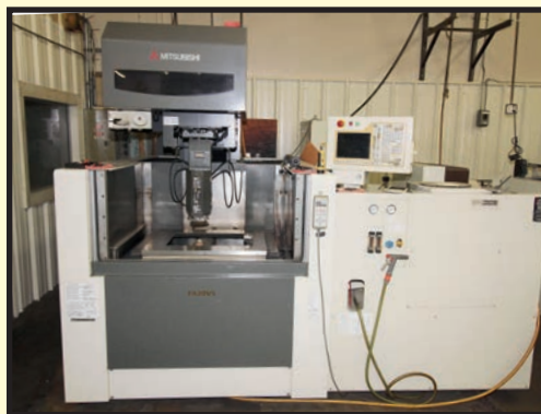
MITSUBISHI MDL. FA20VSM WIRE EDM

Monday, December 6, 9:00 A.M. to 4:00 P.M.