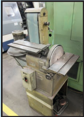
POWERMATIC BELT AND DISC GRINDER

BALDOR DOUBLE END GRINDER; RIGHT ANGLE GRINDERS; SANDERS; DRILL GRINDERS; AC-CU-FINISH SERIES II CARBIDE GRINDERS; DAREX MDL. SP2500 SUPER PRECISION DRILL SHARPENER; DRILL PRESSES; PORTABLE MAPLE TOP ROLLER DRAWER CABINETS; ROLL-IN BANDSAW; ARBOR PRESSES; SANDSTORM BLAST CABINET AND RECLAMATION SYSTEM; PARTS WASHER; POWERMATIC BELT AND DISC GRINDER; BURR KING DEBURRING MACHINES; DUMP HOPPERS; RIDGID MDL. 1822-1 PIPE THREADERS; RIDGID MDL. 300 PIPE THREADER.