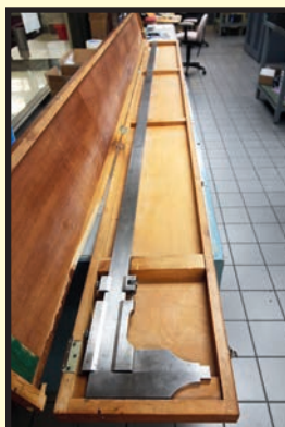
LARGE CAP. VERNIER CALIPER