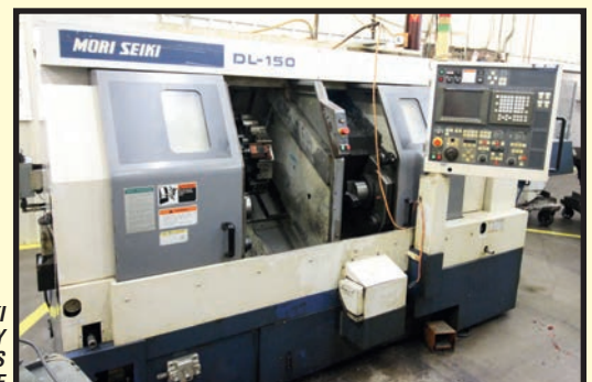
MORI SEIKI MDL. DL-150Y CNC MULTI-AXIS LATHE