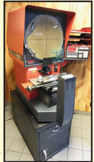
STARRETT SIGMA MDL. HB400 OPTICAL COMPARATOR