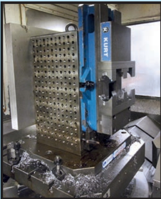
SAMPLE VIEW OF TOMBSTONES

PALLET JACKS; CANTILEVER RACKS; H.D. METAL ROLLER CARTS.