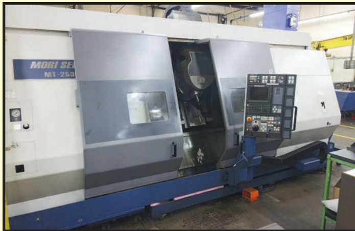
MORI SEIKI MDL. MT-253S/1500 CNC MULTI-AXIS LATHE