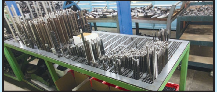
SAMPLE VIEW OF SETUP TOOLING