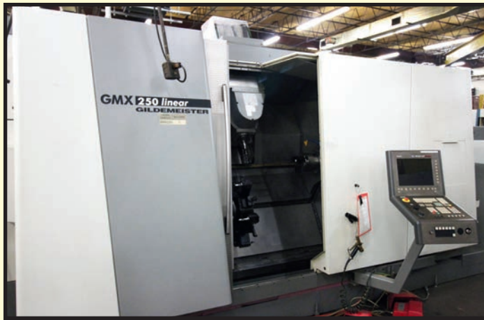
GILDEMEISTER MDL. GMX250 LINEAR CNC MULTI-AXIS LATHE