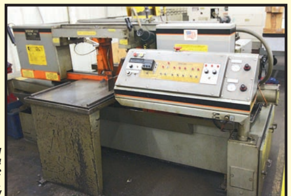
HEM MDL. H130HA-4 AUTOMATIC HORIZONTAL BANDSAW