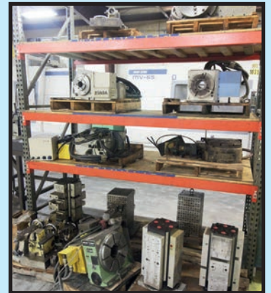
SAMPLE VIEW OF 4TH AXIS