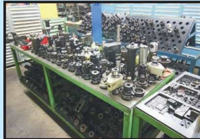
SAMPLE VIEW OF CAT-50 TOOLING