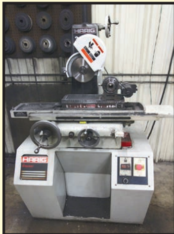
HARIG 6" X 18" SURFACE GRINDER

FOR ONLINE BIDDING AT THIS AUCTION. Go to www.pmi-auction.com and click on BidSpotter on our calendar page for this auction sale.