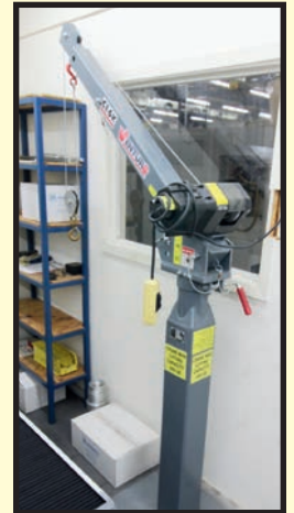
(1 OF 2) VETURO 1,400-LB. CAP. ENGINE HOISTS

REAL ESTATE TO BE AUCTIONED ON WEDNESDAY, DECEMBER 8 (See Back Page)