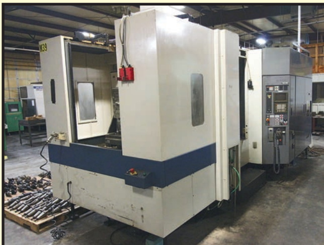
MORI SEIKI MDL. MH-63 CNC HORIZONTAL MACHINING CENTER

SUNNEN MDL. MBB-1660 , tooling cabinet, S/N 84559.