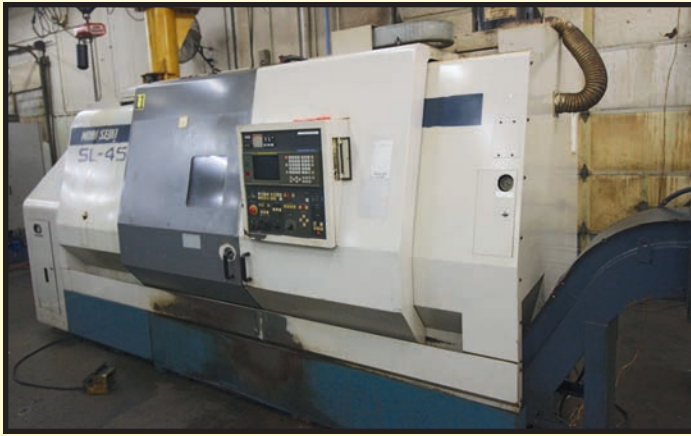
MORI SEIKI MDL. SL-45C/1000 CNC LATHE