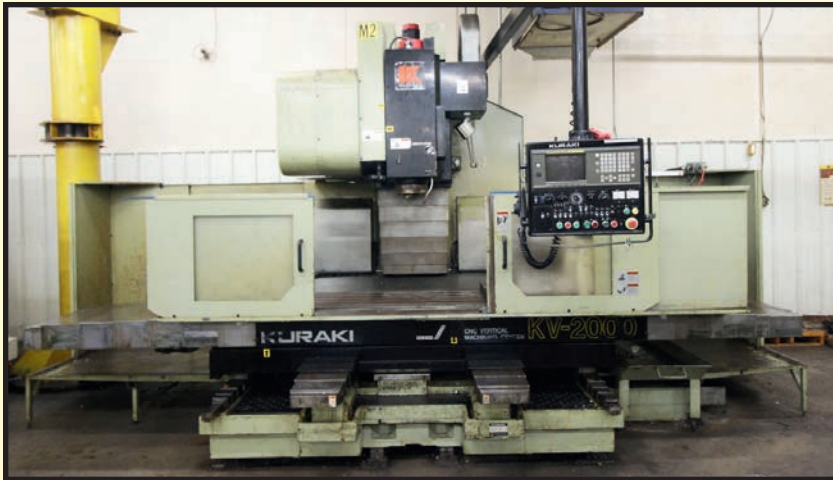
KURAKI MDL. KV-2000 CNC VERTICAL MACHINING CENTER