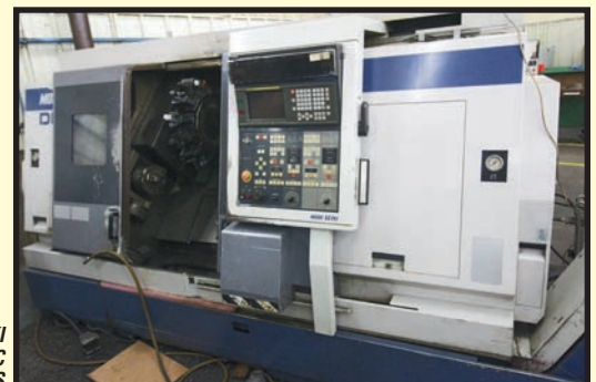
(1 OF 2) MORI SEIKI MDL. SL-25MC CNC MULTI-AXIS LATHES

MORI SEIKI MDL. ZL-35B/750 , MF-D4 CNC control, 12" dia. pwr. chuck, 10-pos. upper and lower turrets, S/N 39.