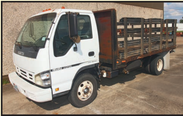
2006 ISUZU FLATBED TRUCK