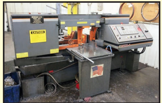
HEM MDL. H105LA AUTOMATIC HORIZONTAL BANDSAW