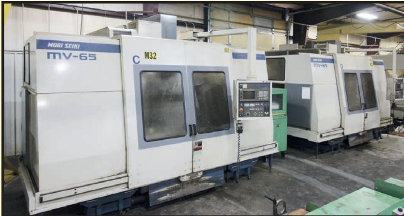
(1 OF 6) MORI SEIKI MDL. MV-65/50 CNC VERTICAL MACHINING CENTERS