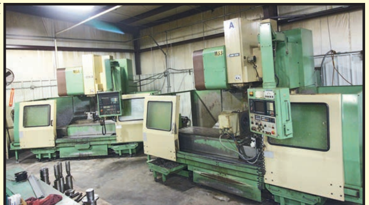
(1 OF 2) EXCEL MDL. PMC-10T24 CNC VERTICAL MACHINING CENTERS