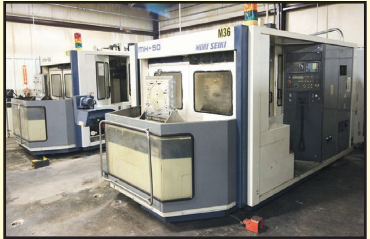
(1 OF 4) MORI SEIKI MDL. MH-50 CNC HORIZONTAL MACHINING CENTERS