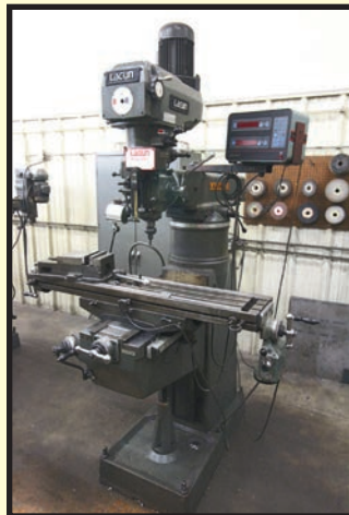
(1 OF 2) LAGUN MDL. FTV-2 VERTICAL TURRET MILLS