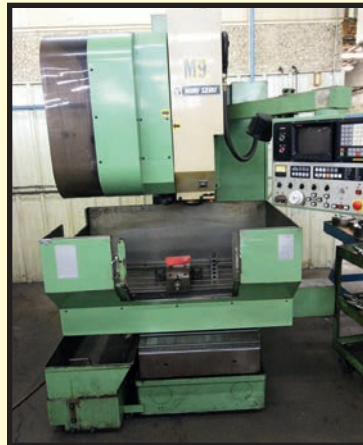
MORI SEIKI MDL. MV-JUNIOR CNC VERTICAL MACHINING CENTER