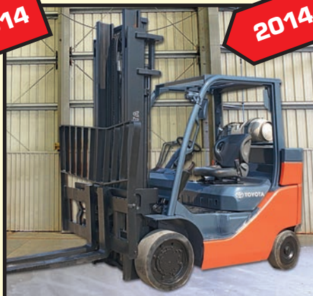
TOYOTA 8,000-LB. BASE CAP. FORKLIFT