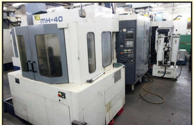
MORI SEIKI MDL. MH-40 CNC HORIZONTAL MACHINING CENTER