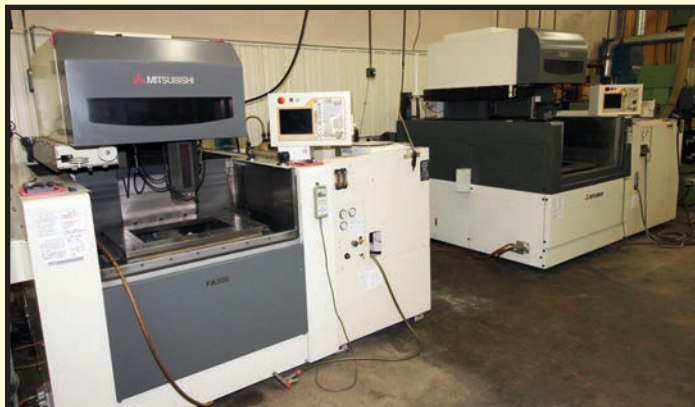
SAMPLE VIEW MITSUBISHI WIRE EDMS