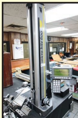
BROWN & SHARPE MICRO-HITE 600 DIGITAL HEIGHT GAUGE