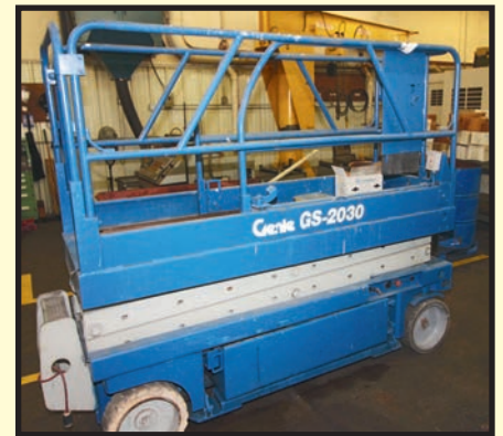
GENIE MDL. GS-2030 ELECTRIC MANLIFT