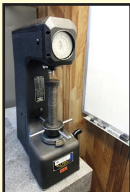
CLARK INSTRUMENT MDL. DCR-8 HARDNESS TESTER