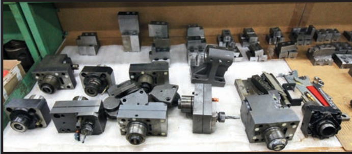
SAMPLE VIEW OF LIVE TOOLING