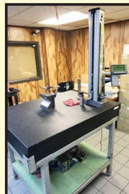
DIGITAL HEIGHT GAUGE W/GRANITE PLATE