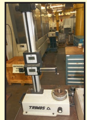
TRIMOS TOOL PRESETTER