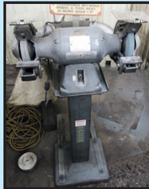
BALDOR DOUBLE END GRINDER