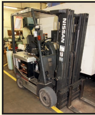
(1 OF 2) NISSAN 4,200-LB. BASE CAP. ELECTRIC FORKLIFTS