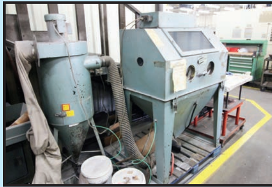
VIEW OF BLAST CABINET