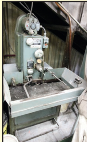
SUNNEN MDL. MBB-1660 HONE

(5) MORI SEIKI MDL. MH-63 , MSC-516 CNC control, 24.8" pallet size, 40"X, 41"Y, 30" Z-axis travels, 50 taper, 120-pos. ATC, S/N 107 (1996), S/N 747 (1996), S/N 679, S/N 151, S/N 748 w/60-pos. ATC.