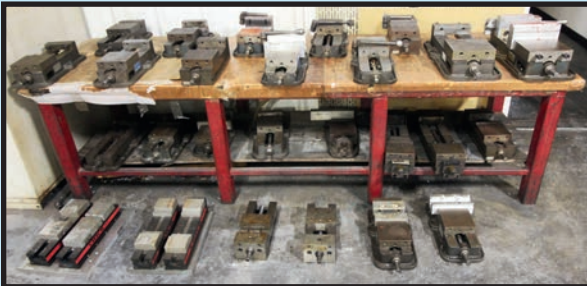
SAMPLE VIEW OF VISES