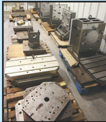
SAMPLE VIEW OF PALLETs AND FIXTURES