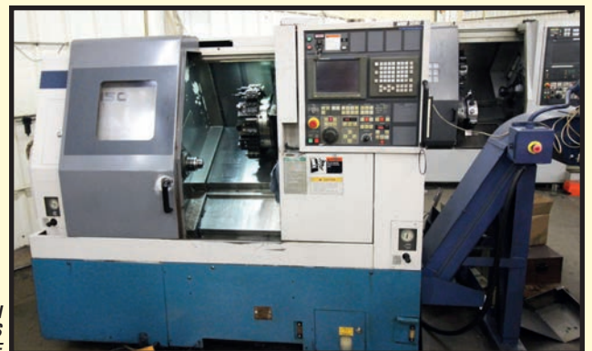
MORI SEIKI MDL. SL-150S CNC LATHE