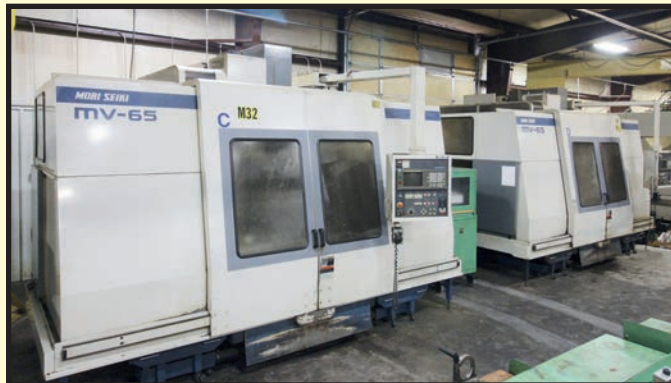
(1 OF 6) MORI SEIKI MDL. MV-65/50 CNC VERTICAL MACHINING CENTERS