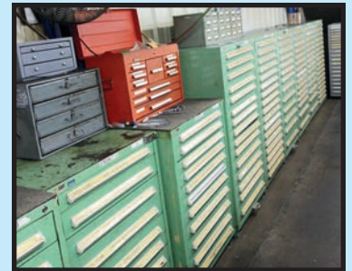
ROLLER DRAWER CABINETS