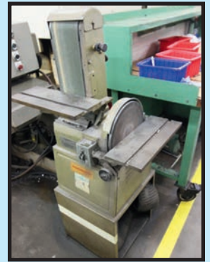
VIEW OF ARBOR PRESS