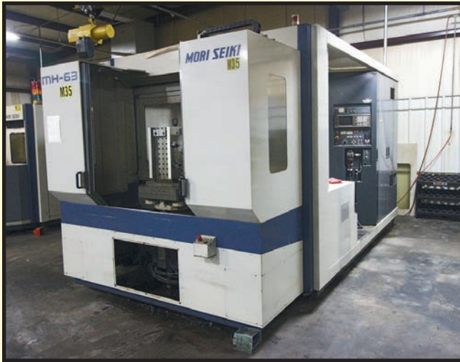
(1 OF 5) MORI SEIKI MDL. MH-63 CNC HORIZONTAL MACHINING CENTERS