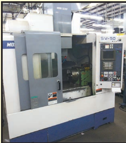
(1 OF 4) MORI SEIKI MDL. SV-50/40 CNC VERTICAL MACHINING CENTERS