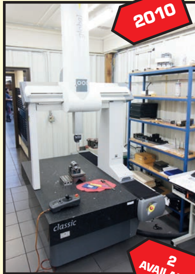
BROWN & SHARPE GLOBAL CLASSIC C.M.M.

Monday, December 6, 9:00 A.M. to 4:00 P.M.