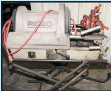
RIDGID PIPE THREADER