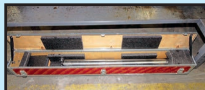
SANDVIK DEVIBE BAR