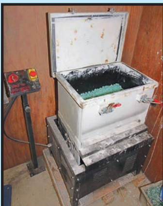
TUMBLE VIBRATORY PARTS CLEANER