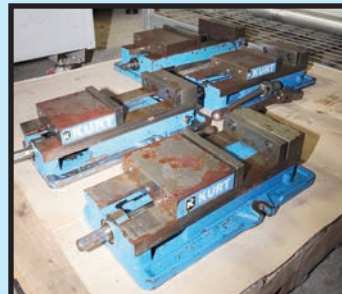
SAMPLE VIEW OF KURT VISES

Go to www.pmi-auction.com and click on BidSpotter.com or proxibid on our calendar page for this auction sale.