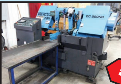
DOALL CONTINENTAL SERIES AUTOMATIC HORIZONTAL BANDSAW