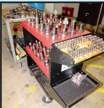
CAT 40 TOOLING