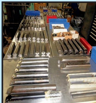
SAMPLE VIEW OF BORING BARS