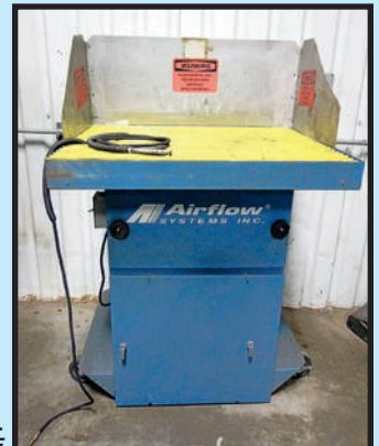
AIRFLOW SYSTEMS, INC. DOWNDRAFT TABLE