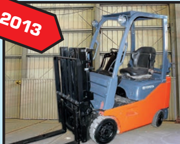
TOYOTA 3,000-LB. BASE CAP. FORKLIFT