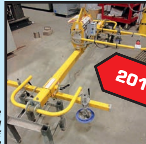
ANVER VACUUM PLATE LIFTER