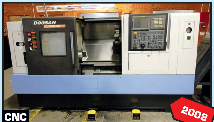
DOOSAN PUMA MDL. 280 CNC LATHE