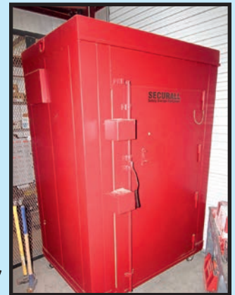
SECURE ALL FLAME PROOF STORAGE CABINET