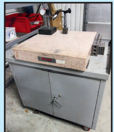
STARRETT GRANITE SURFACE PLATE