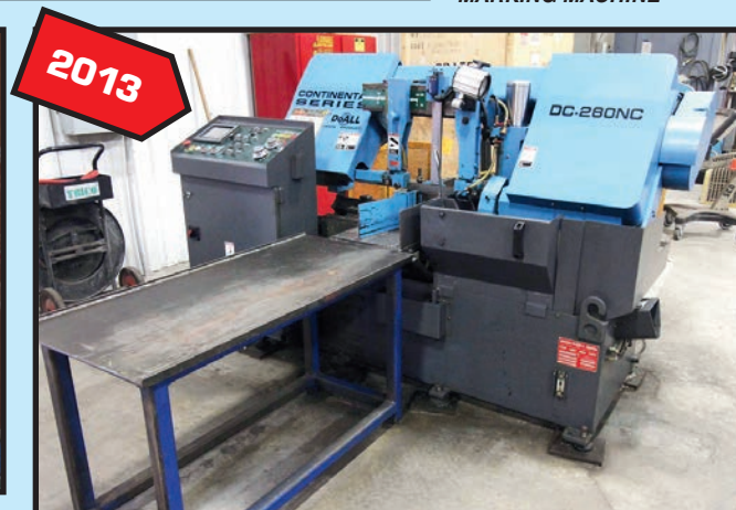
DOALL CONTINENTAL SERIES AUTOMATIC HORIZONTAL BANDSAW