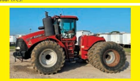
2014 CASE 580HD STEIGER SN:ZEF301382 powered by Case IHFPT diesel engine, 580.7hp, equipped with EROPS, air, heat, 16F x 2R full powershift transmission, quad couplers, scraper hitch, front counterweights, 800/70R32 dual tires.

2014 CASE 580HD STEIGER SN:ZEF301482 powered by Case IHFPT diesel engine, 580.7hp, equipped with EROPS, air, heat, 16F x 2R full powershift transmission, quad couplers, scraper hitch, front counterweights, 800/70R32 dual tires.