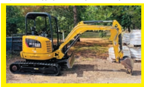
2020 CAT 302.7D SN:LJ701931 powered by diesel engine, equipped with OROPS, front blade, auxiliary hydraulics, rubber tracks, 18in. Digging bucket, 1,663 hours. Premier warranty expiring 08/21/2022.

2012 CAT 320EL SN:WBK01075 powered by Cat diesel engine, equipped with Cab, air, heat, 31in. Pads, quick coupler, 48in. Digging bucket, long undercarriage.