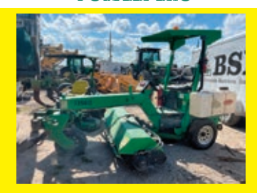
LAYMOR SM300 SN:35912 powered by Kubota diesel engine, equipped with OROPS, 8ft. Broom, water system, ST205/75R14 tires, 642 hours.

LAYMOR SM300 SN:34675 powered by Kubota diesel engine, equipped with OROPS, 8ft. Broom, water system, ST205/75R14 tires, 864 hours.