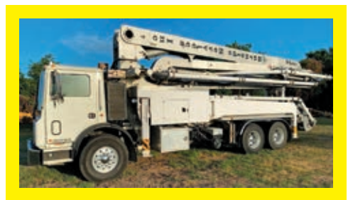
2012 MACK MRU613 VN:DM009667 powered by Mack MP7 diesel engine, equipped with Eaton 8 speed transmission, power steering, 2012 Alliance JXR37-4.16 pumper (sn:1206), 123ft. 4in. Reach height, tandem axle.