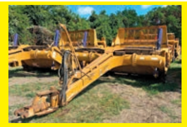
2014 K-TEC 1233 SN:KS2392 equipped with 33 cubic yard capacity, 80,000lb capacity, 12ft. Wide x 4ft. 3in. High x 12ft. 10in. Long, 23.5R25 radial rubber.