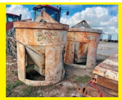
(2) CONCRETE BUCKET