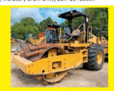
CAT CP56B SN:C5P00209 powered by Cat diesel engine, equipped with OROPS, 84in. padsfoot drum, vibratory drum, drum drive, 23.1-26 rubber.

2007 CAT CS-533E SN:DAK00554 powered by Cat diesel engine, equipped with OROPS, 84in. Smooth drum, vibratory drum, drum drive, 18-26 rubber.