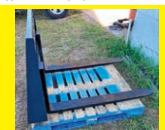
<mark>NEW TROJAN FORKS</mark> 48IN. FORKS