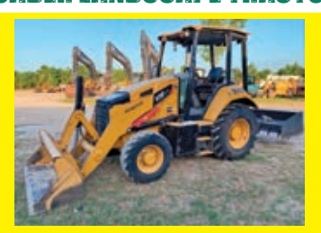
CAT 415F SN:CPF401137 4x4, powered by Cat diesel engine, equipped with OROPS, GP front bucket, box blade, ripper, 2,575 hours.