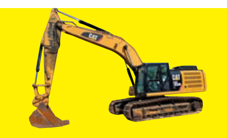
2018 CAT 336FL SN:TZA20114 powered by Cat diesel engine, equipped with Cab, air, heat, 28in. Pads, quick coupler, 60in. Digging bucket, long undercarriage.

CAT 349FL SN:797 powered by Cat diesel engine, equipped with Cab, air, heat, 35.6in. Pads, 80in. Digging bucket, long undercarriage.