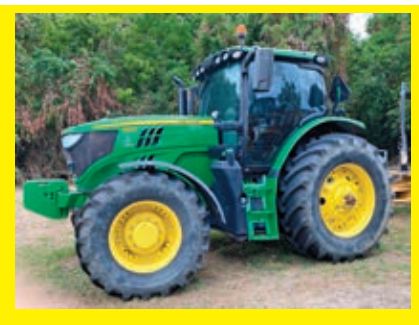
JOHN DEERE 6155R VN:1BW615SRJD028629 powered by John Deere diesel engine, equipped with OROPS, 3pt hitch, PTO, front counterweights, 540/65R28 front rubber, 650/65R38 rear rubber.

JOHN DEERE 6420 SN:394493 4x4, powered by John Deere diesel engine, equipped with EROPS, air, heat, 3pt hitch, Spectra precision, 3,747 hours.