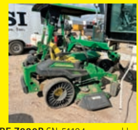
JOHN DEERE Z930R SN:51194 powered by gas engine, equipped with 7 Iron Pro 60 deck, zero turn, 134 hours.