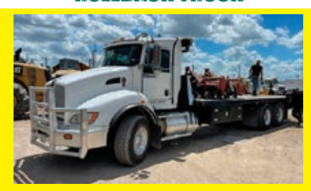
2012 KENWORTH T440 VN:956363 powered by Paccar PX–8 engine, 330hp, equipped with Allison automatic transmission, a/c, 28ft rolloff body, winch, hydraulic rear hitch, air ride suspension, aluminum wheels, 11R22.5 tires, tandem axle, 187,000 miles.