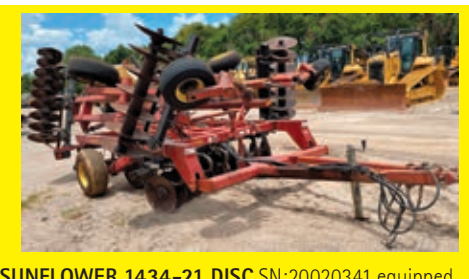
SUNFLOWER 1434-21 DISC SN:20020341 equipped