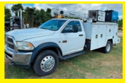
2012 FORD F550 VN:235441 4x4, powered by Cummins diesel engine, equipped with automatic transmission, power steering, Maintainer service body, Maintainer 6,500lb crane, RC-40 air compressor, Bobcat welder, dual wheel single axle, 255,266 miles.

2015 FORD F650 VN:A00870 powered by 6.7L Power Stroke diesel engine, equipped with automatic transmission, power steering, service body, Autocrane 8,000lb crane, Palfinger PRC 45V air compressor, Miller Bobcat welder, hydraulic outriggers, dual wheel single axle, 93,425 miles.