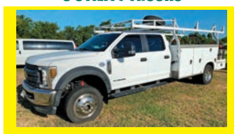
2018 FORD F550XL VN:B85590 4x4, powered by 6.7L Power Stroke diesel engine, equipped with automatic transmission, power steering, crew cab, Royal 12ft. Utility body, dual wheel single axle, 170,222 miles.

2016 FORD F350 VN:B56101 powered by V8 gas engine, equipped with automatic transmission, power steering, dual wheel single axle, 174,481 miles.