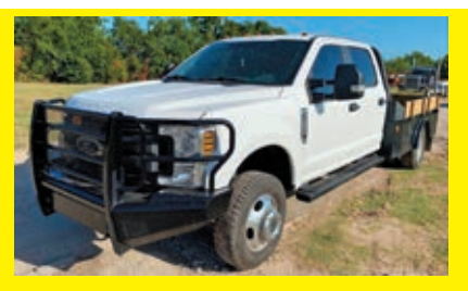
2018 FORD F350XL VN:C23257 4x4, powered by 6.2L gas engine, equipped with automatic transmission, power steering, crew cab, Norstar 9ft. Flatbed body, gooseneck hitch. 87.772 miles.

2020 FORD F450 KING RANCH powered by 6.7L Power Stroke diesel engine, equipped with automatic transmission, power steering, crew cab, flatbed body, dual wheel single axle, 43,553 miles.