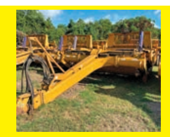
2013 K-TEC 1233 SN:KS2358 equipped with 33 cubic yard capacity, 80,000lb capacity, 12ft. Wide x 4ft. 3in. High x 12ft. 10in. Long, 23.5R25 radial rubber.