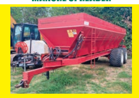
SN:27147 hydraulic drivn, 700/40x22.5 tires.