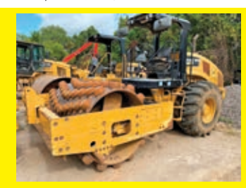
2014 CAT CP56B SN:LHC00480 powered by Cat diesel engine, equipped with OROPS, 84in. padsfoot drum, vibratory drum, drum drive, 23.1-26 rubber, 3,911 hours. 2013 CAT CP56B SN:LHC00243 powered by diesel engine, equipped with OROPS, 84in. Padsfoot drum, vibratory drum, drum drive.

2015 CAT CS66B SN:S66D0122 powered by Cat diesel engine, equipped with EROPS, air, heat, 84in. Smooth drum, vibratory drum, 570/75-26R rubber.