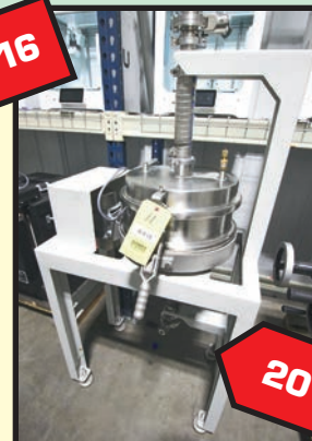
POWDER RECOVERY SYSTEM