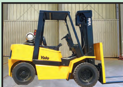
YALE 8,000-LB. BASE CAP. LPG FORKLIFT