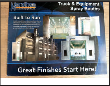
MARATHON PRESSURIZED SIDE DOWN DRAFT SPRAY BOOTH