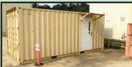
20' CONEX W/MAN DOOR