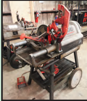
RIDGID MDL. 1224 PIPE THREADER