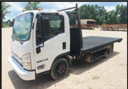
FLATBED TRUCK 2007 ISUZU NPR, diesel, 191,313 H.O.M., VIN JALB4W16677400177.