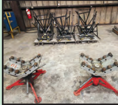
ASSORTED HELPER STANDS