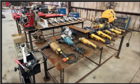
SAMPLE VIEW OF POWER AND HAND TOOLS