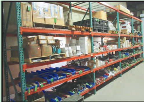
DAY 2: PARTS INVENTORY