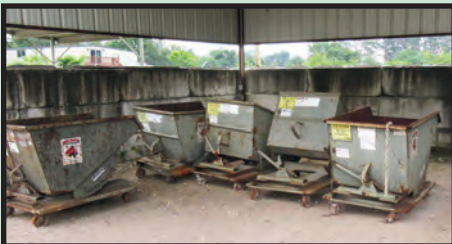
SAMPLE VIEW OF HOPPERS