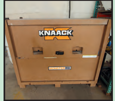
SAMPLE VIEW OF KNAACK TOOL BOXES