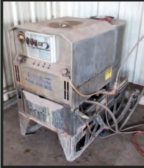
HEATED WATER PRESSURE WASHER