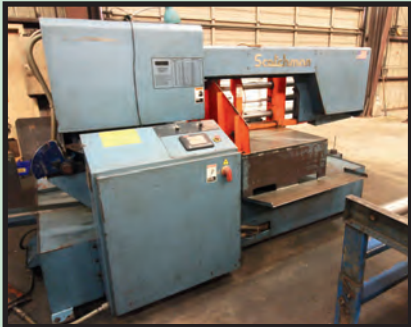
SCOTCHMAN AUTOMATIC HORIZONTAL BANDSAW