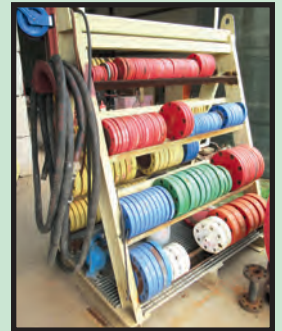
DAY 2: PRESSURE TEST EQUIPMENT