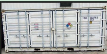
OPEN SIDE CONEX W/SIDE DOORS