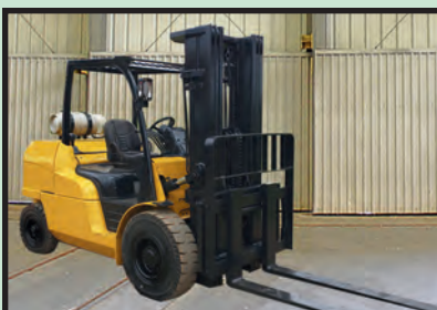
CATERPILLAR 12,000-LB. BASE CAP. LPG FORKLIFT

MARATHON PRESSURIZED SIDE DOWN DRAFT SPRAY BOOTH MDL. SDDT-252060-70L-P-DT , Mfg. 2016, unused and uninstalled, booth dimensions: I.D. 25'W. x 20'H. x 60' working depth, (2 sets) bi-fold 20'W. x 18'H. drive through doors w/windows, complete w/full set of drawings, intake and exhaust systems, lights, doors, windows, motors, fans and hardware. (Orig. cost of $163K).