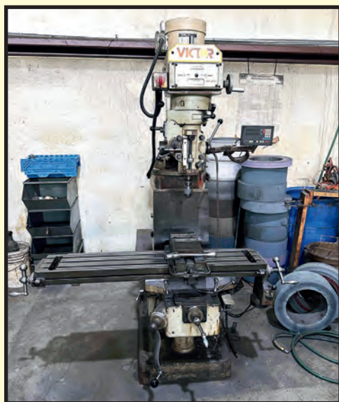
VICTOR JF-2VS VERTICAL TURRET MILL