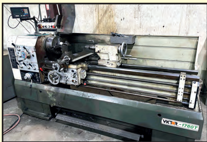
VICTOR 1760T ENGINE LATHE