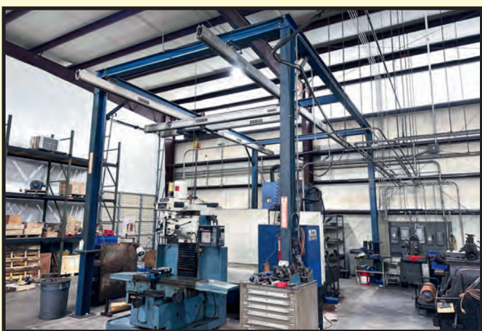
KNIGHT GLOBAL FLOOR MOUNTED RAIL SYSTEM