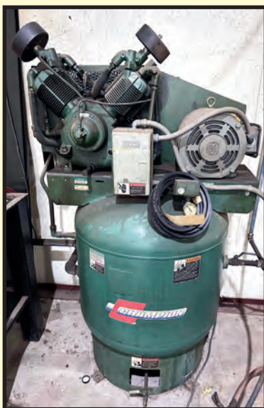
CHAMPION AIR COMPRESSOR