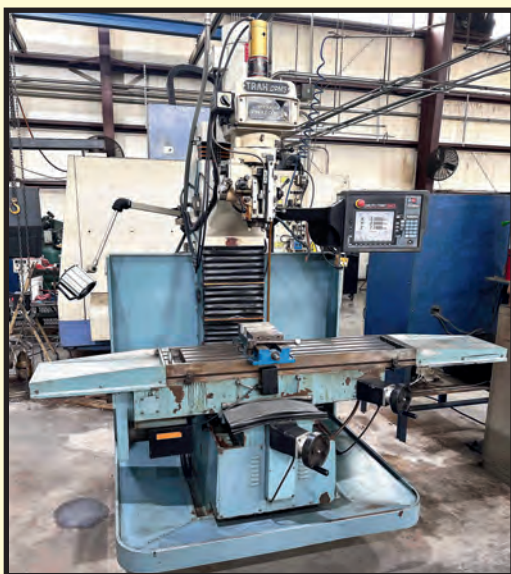
TRAK DPM5 CNC BED MILL