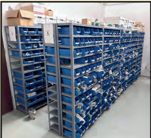
SAMPLE VIEW OF TOOLING

PLANT CLOSING: CNC LATHES & SCREW MACHINE; VERT. TURRET MILL; ENGINE LATHE; PRESSES; HIGH PRESSURE COOLANT SYSTEM; GANTRY CRANE SYSTEM; SHOP SUPPORT; OFFICES; INVENTORY; MORE!