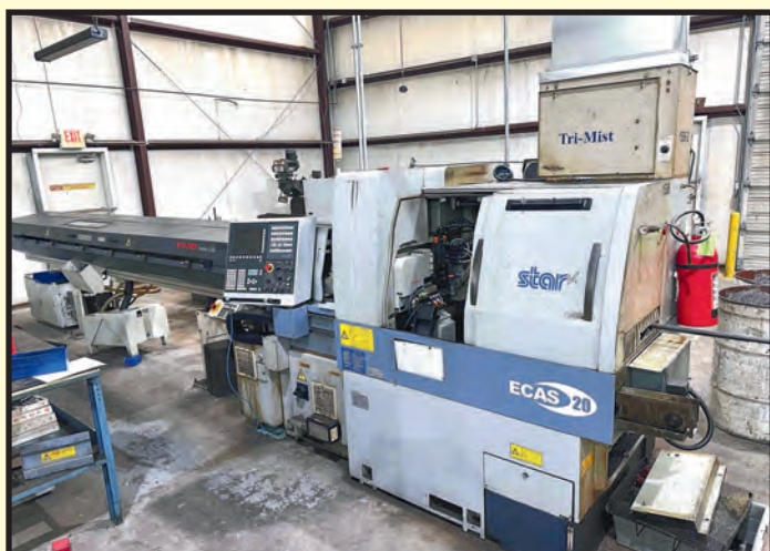
SWISS STAR ECAS-20 CNC SCREW MACHINE