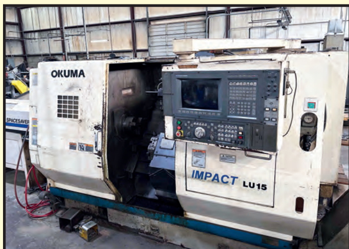
OKUMA IMPACT LU15 CNC LATHE