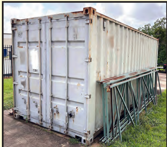
20' CONEX BOX

PLANT CLOSING: CNC LATHES & SCREW MACHINE; VERT. TURRET MILL; ENGINE LATHE; PRESSES; HIGH PRESSURE COOLANT SYSTEM; GANTRY CRANE SYSTEM; SHOP SUPPORT; OFFICES; INVENTORY; MORE!