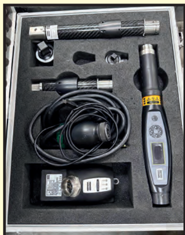
ATLAS COPCO SMART TORQUE WRENCH

DATE: THURSDAY, JULY 10 • 10:00 A.M. CDT LIVE WEBCAST – NO ONSITE BIDDING LOCATION: HOUSTON, TEXAS