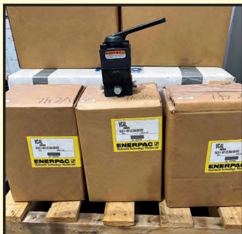
ENERPAC DIRECTIONAL CONTROL VALVES