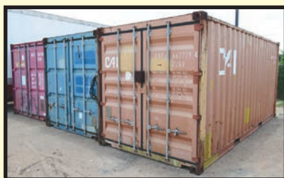
SAMPLE VIEW OF CONEX BOXES