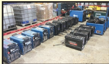
SAMPLE VIEW OF WELDERS AND WIRE FEEDERS

INSPECTION: Varies by Location. See Online Brochure For Details.