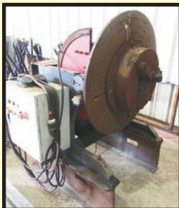
JMT HB6 1,320-LB. WELDING POSITIONER