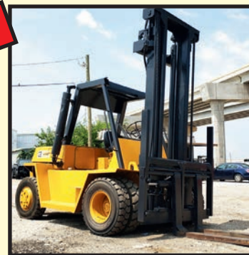
CATERPILLAR 13,000-LB. BASE CAP. DIESEL FORKLIFT