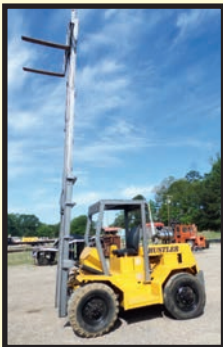
HUSTLER 8,000-LB. BASE CAP. DIESEL FORKLIFT