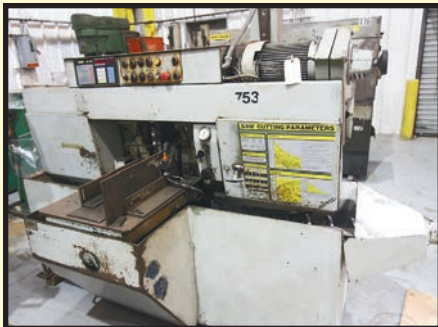
HYD-MECH MDL. H-12A AUTOMATIC HORIZONTAL BANDSAW