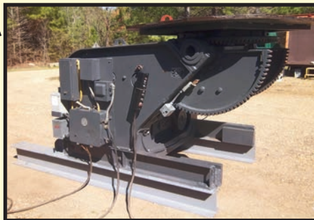
RANSOME 16,000-LB. CAP. WELDING POSITIONER