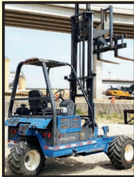
PRINCETON 5,000-LB. BASE CAP. DIESEL FORKLIFT