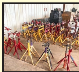
SAMPLE VIEW OF ROLLER AND JACK STANDS