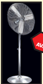
30" PEDESTAL FAN (NEW IN BOX)

Presorted First Class Mail U.S. Postage PAID Eugene, Oregon Permit No. 17