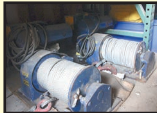
MAX AC36B WINCHES