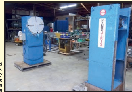
PANDJIRIS 6,000-LB. CAP. HEADSTOCK/ TAILSTOCK WELDING POSITIONER

INSPECTION: Varies by Location. See Online Brochure For Details.