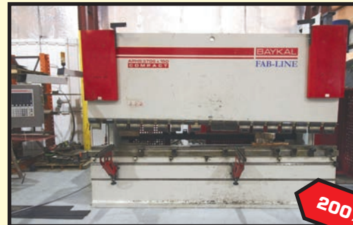
BAYKAL 150 T. X 12' HYDRAULIC PRESSBRAKE