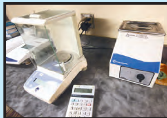
SAMPLE VIEW OF Q.C. EQUIPMENT