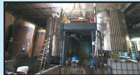
SS MIXING TANKS