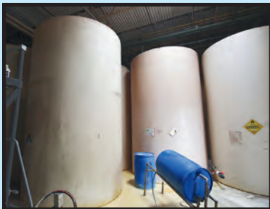
PLASTIC WATER STORAGE TANKS