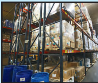
SAMPLE VIEW OF FINISHED GOODS INVENTORY

DETAILED CATALOG OF SALE W/PHOTOS OF EQUIPMENT COMING SOON. CHECK OUR WEBSITE AT WWW.PMI-AUCTION.COM • TIMED AUCTION: MAY 7