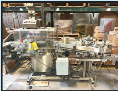
NEWMAN NV2 LABELING MACHINE