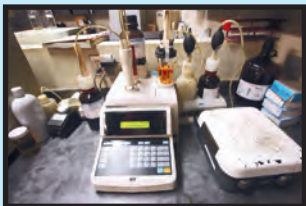
SAMPLE VIEW OF LABORATORY EQUIPMENT

Presorted First Class Mail U.S. Postage PAID Eugene, Oregon Permit No. 17