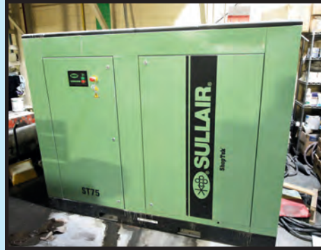
2022 SULLAIR 100 HP AIR COMPRESSOR