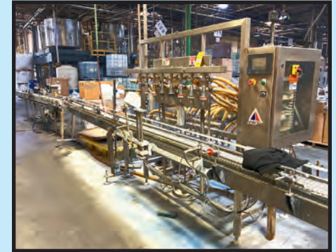
SAMPLE VIEW OF FILLING LINES

INSPECTION: Monday & Tuesday, May 5 & 6 9:00 A.M. to 4:00 P.M. Each Day