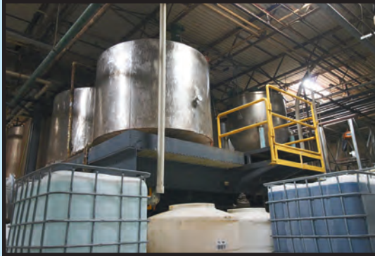
SS TANK FARM AND TOTES

(NO ONSITE BIDDING): YOU MUST REGISTER IN ADVANCE FOR ONLINE BIDDING AT THIS AUCTION. Go to www.pmi-auction.com and click on BidSpotter on our calendar page for this auction sale.