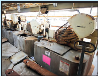
SAMPLE VIEW OF MIXING TANKS

Featuring: Large Quantity of SS and Fiberglass Tanks; Plant Support Equip. Incl. 2022 SULLAIR 100 HP Air Compressor; Water Purification Equip.; Large Qty. Pallet Racks; Inventory: Super Sacks, Barrels and Boxes of Additives, Fragrances, Cleaning Solutions and Other Materials; M.R.O. Supplies; Quality Control Laboratory; Machine Shop; Offices; More! See Catalog For Detailed Lots w/Descriptions and Photos.