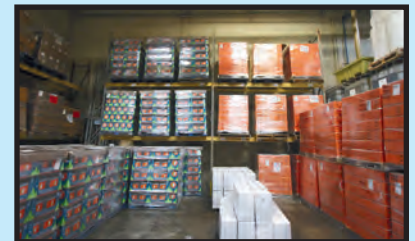
LARGE QTY. FINISHED GOODS

DETAILED CATALOG OF SALE W/PHOTOS OF EQUIPMENT COMING SOON. CHECK OUR WEBSITE AT WWW.PMI-AUCTION.COM • TIMED AUCTION: MAY 7