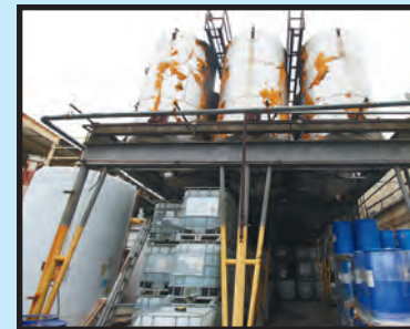
SAMPLE VIEW OF TANK FARMS