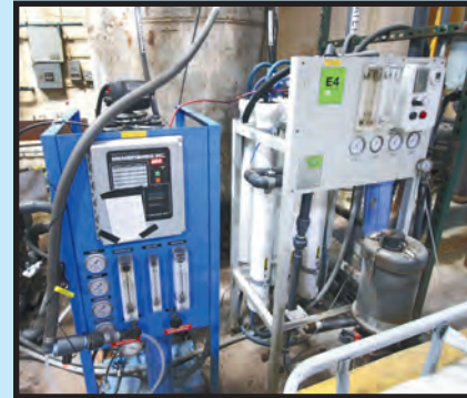
WATER PURIFICATION SYSTEMS