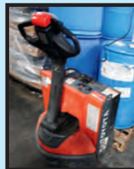
WALK-BEHIND ELECTRIC JACK