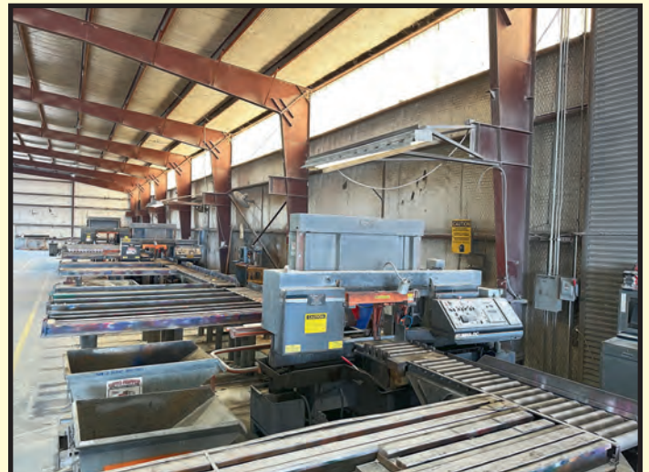
VIEW OF HE&M HORIZ. BANDSAWS W/ MATERIAL HANDLING SYSTEMS