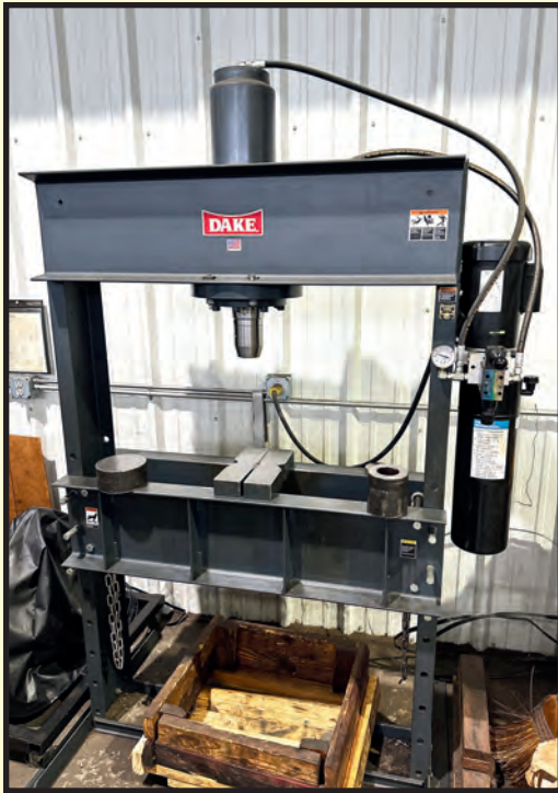
DAKE MDL. 50DA (909250) HYDRAULIC PRESS