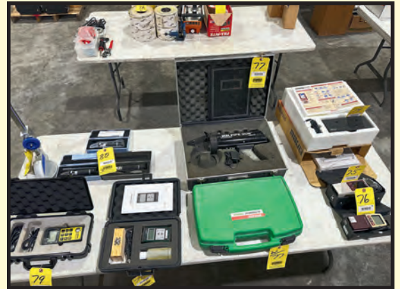
SAMPLE VIEW OF ELECTRONIC Q.C.

FOR BIDDING AT THIS AUCTION. Go to www.pmi-auction.com and click on BidSpotter or proxibid on our calendar page for this auction sale.