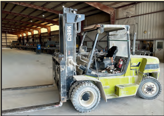
CLARK 14,100-LB. BASE CAP. FORKLIFT