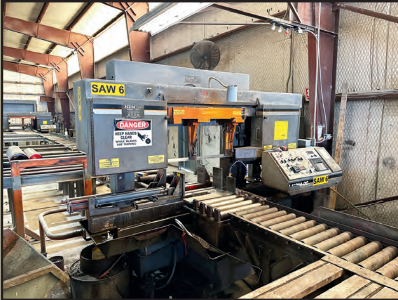
HE&M H130HA-DC HORIZ. BANDSAW

(4) HE&M MDL H105LM , 16"W. x 14"H., blade: 15'0"L. x 1.25"H. x .042", motor: 7.5 HP, 220/440 v., operation: semi-automatic, S/N 944706, S/N 944606, S/N 872504, S/N 607798.