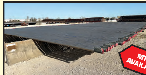
HUGE SELECTION OF OCTG INVENTORY