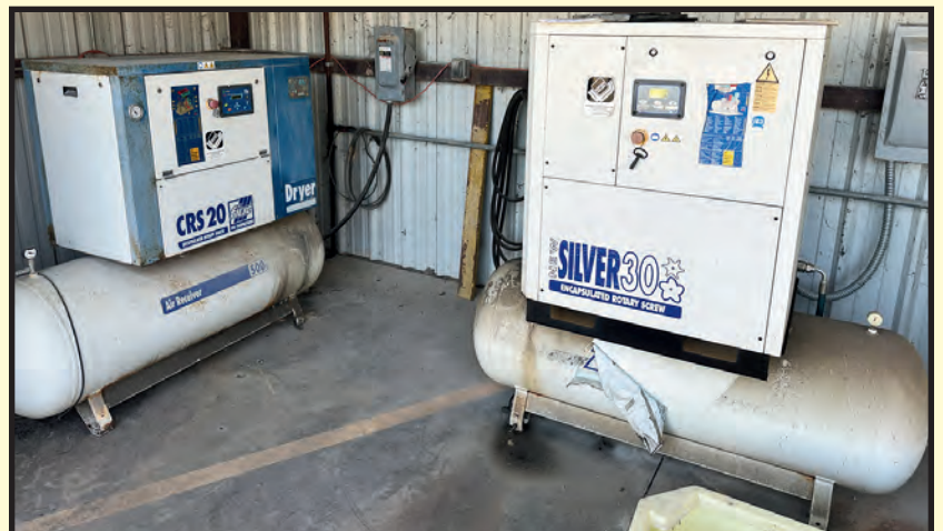
FIAC CRS20 AND SILVER 30 AIR COMPRESSORS