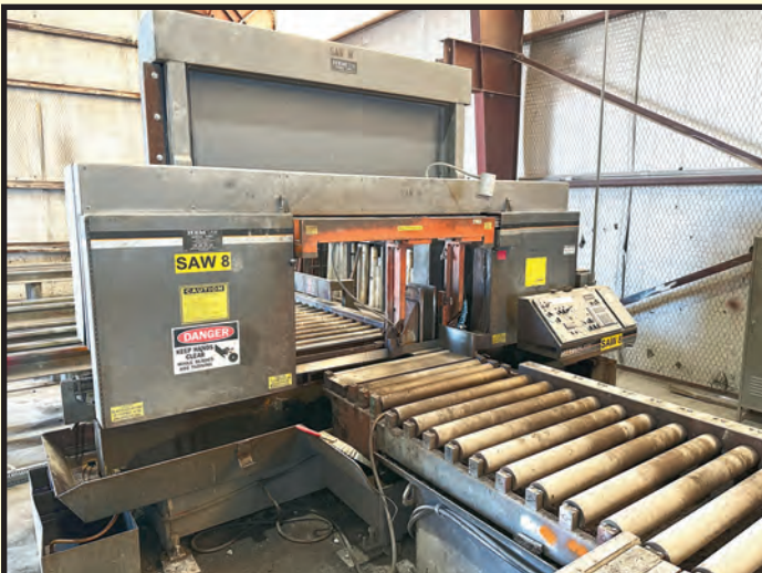
HE&M MDL H3236M-DC HORIZ. BANDSAW