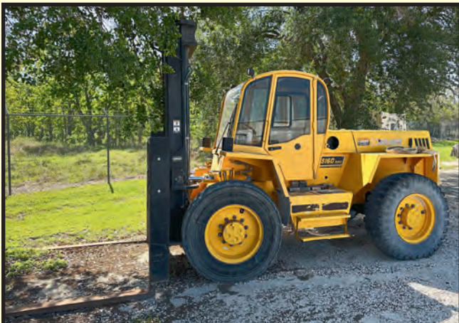
SELICK 16,000-LB. BASE CAP. ROUGH TERRAIN FORKLIFT