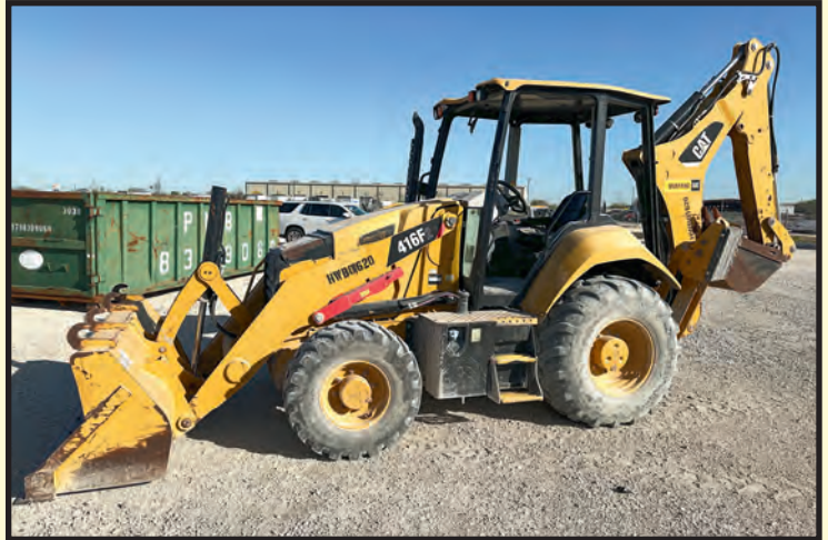
CATERPILLAR MDL. 416F2 FRONT END LOADER AND BACKHOE