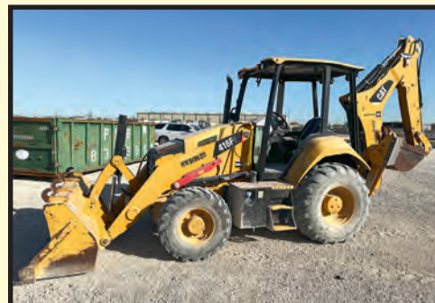
CATERPILLAR MDL. 416F2 FRONT END LOADER AND BACKHOE

Read Partial Terms and Conditions on Page 6