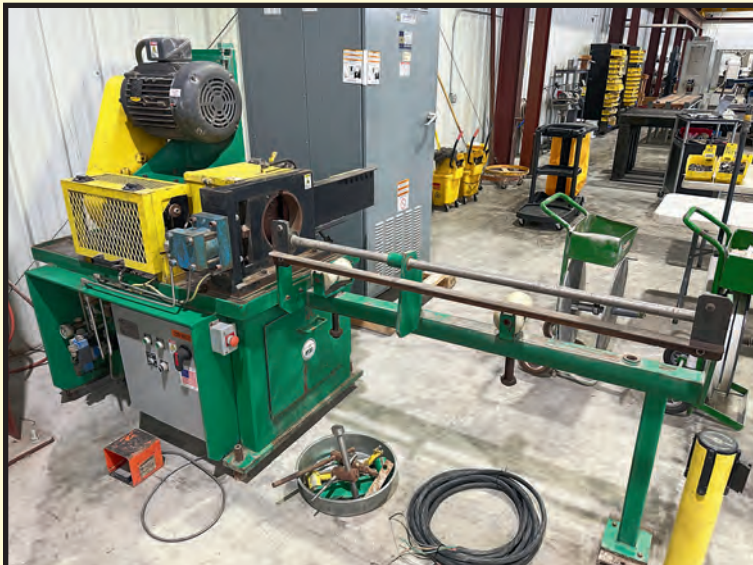
MSI CHAMFERMATE MDL. C8H PIPE BEVELING AND DEBURRING MACHINE

DAY 2 & 3: Tuesday – Friday, May 13 – 16 & Monday, May 19, 9:00 A.M. to 4:00 P.M. Each Day