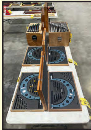
SAMPLE VIEW OF Q.C.