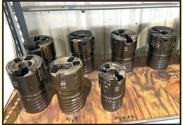
BTA DRILLING HEADS