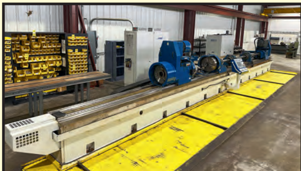
UNISIG MDL. B500-4M DEEP HOLE DRILLING MACHINE

DAY 1: THURSDAY, MAY 15 10:00 A.M. LIVE ONSITE W/WEBCAST