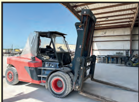
LINDE 33,000-LB. BASE CAP. DIESEL FORKLIFT

DAY 2 & 3: TUESDAY & WEDNESDAY, MAY 20 & 21 TIMED ONLINE AUCTION BIDS START CLOSING 10:00 A.M. EACH DAY