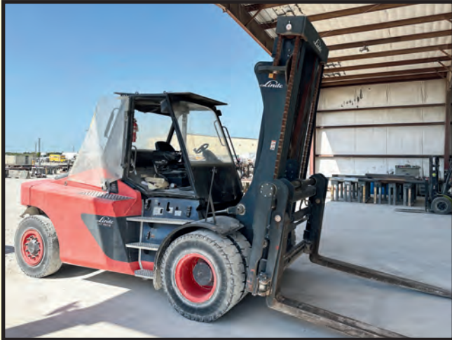
LINDE 33,000-LB. BASE CAP. DIESEL FORKLIFT

DAY 2 & 3 FEATURING: Rare Offering of High Grade OCTG Inventory! Millions of Feet of Nickel & Carbon Alloy Tubing