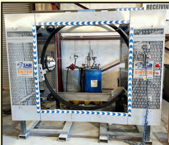
TORNADO TAB PALLET WRAPPER