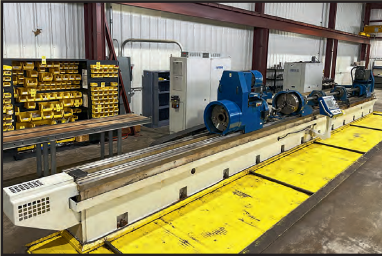
UNISIG MDL B500-4M DEEP HOLE DRILLING MACHINE