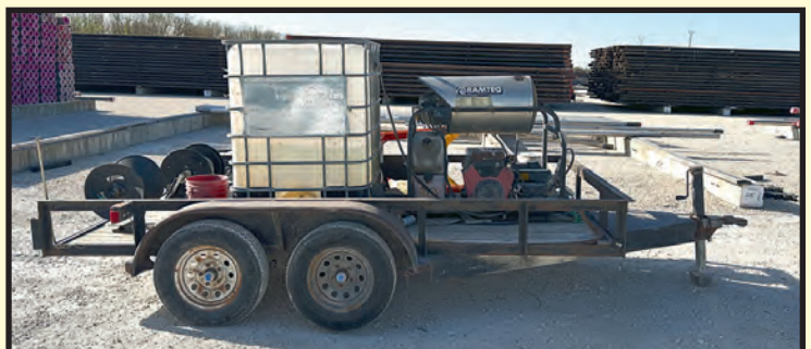
(1 OF 2) UTILITY PRESSURE WASHING TRAILERS

(3) ANCHOR 1 T. JIB CRANES; RIGGING SLINGS; PIPE STANDS; ROLLER CONVEYOR.