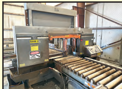
HE&M MDL. H3236M HORIZ. BANDSAW

DAY 2 & 3: Tues. - Fri., May 13 - 16 & Mon., May 19, 9:00 A.M. to 4:00 P.M. Each Day