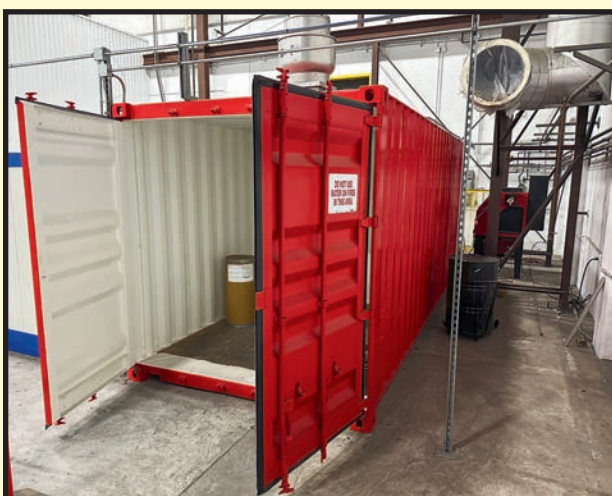
20' VENTILATED 2-SIDED CONEX