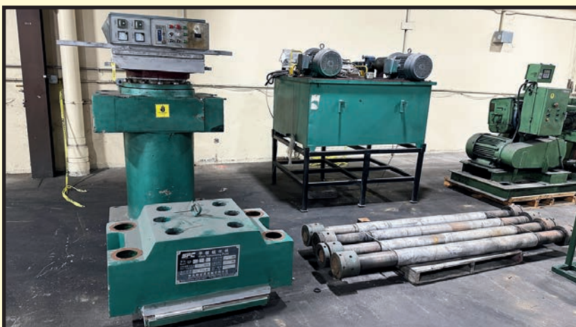
PLATE VULCANIZING PRESS