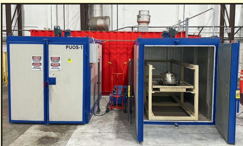
EMM ELECTRIC OVENS