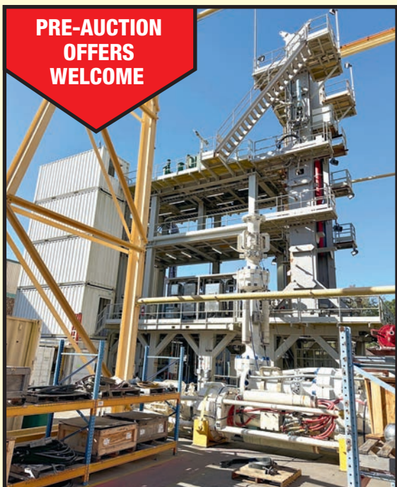
MANAGED PRESSURE DRILLING TEST RIG