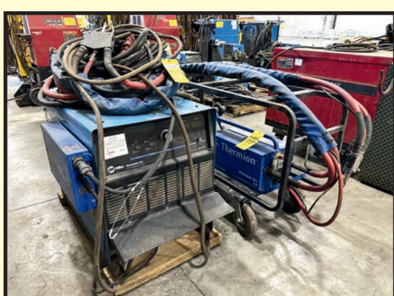
THERMION 2-WIRE SPRAY METAL SYSTEM