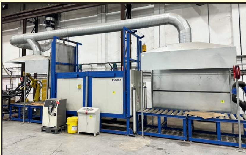
EMM TUNNEL OVEN CONVEYOR LINE