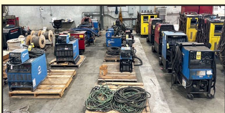
SAMPLE VIEW OF WELDING MACHINES