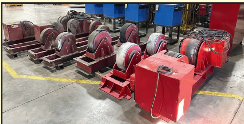
ROMER TURNING ROLL SETS