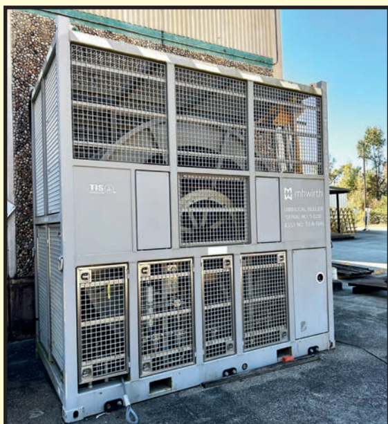
TIS MFG. UMBILICAL REELER