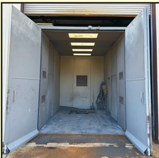
BRECO BLAST ROOM