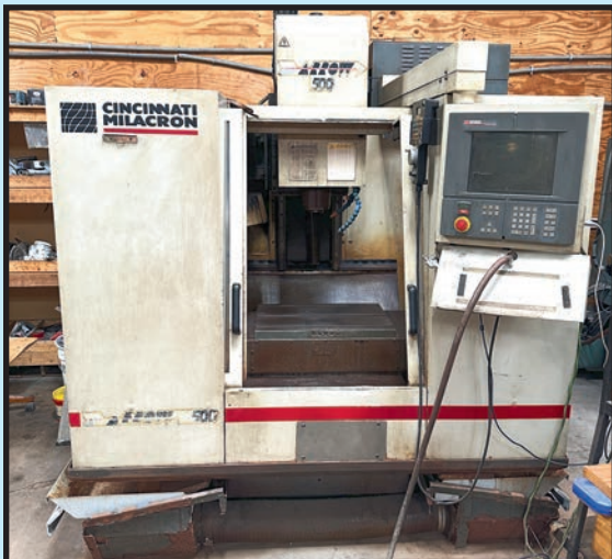
CINCINNATI MDL. ARROW 500 VERTICAL MACHINING CENTER