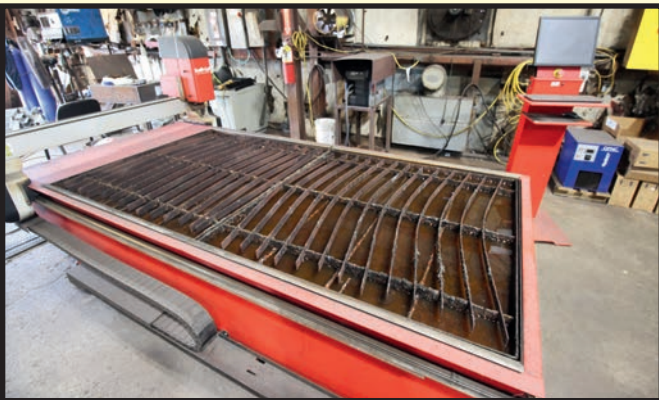
SWIFT-CUT PRO 4' X 8' CAP. CNC PLASMA CUTTING MACHINE, MFG. 2022

Various Plants Downsizing, Closing or Thinning Inventories with 100's of Lots of Fabricating Equipment, Machine Tools, Forklifts, Trucks & SUVs, Antiques & Art!