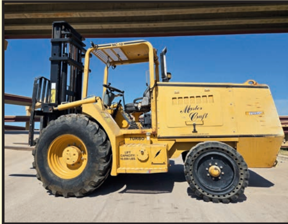
MASTERCRAFT 10,000-LB. BASE CAP. MDL. MC10 DIESEL FORKLIFT

LIVE ONLINE BIDDING ONLY (NO ONSITE BIDDING): YOU MUST REGISTER IN ADVANCE FOR ONLINE BIDDING AT THIS AUCTION. Go to www.pmi-auction.com and click on BidSpotter or proxibid on our current auction page for this sale.