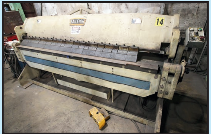
BAILEIGH 8' X 10 GA. MDL. BB-9610H BOX AND PAN BRAKE