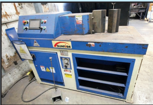
SUNRISE MDL. HBM-82 80 T. X 12" HORIZONTAL BENDING MACHINE