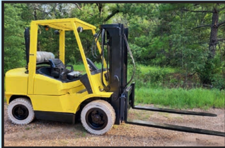
HYSTER 9,000-LB. BASE CAP. MDL. H90XMS LPG FORKLIFT