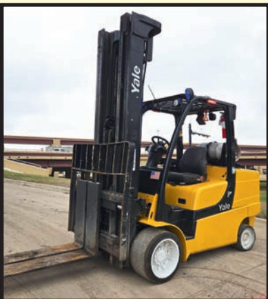
YALE 12,000-LB. BASE CAP. MDL. GLC120 LPG FORKLIFT

TUESDAY, DECEMBER 9 10:00 A.M. CT LIVE ONLINE WEBCAST (NO ONSITE BIDDING)