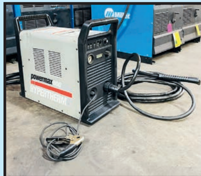
HYPERTHERM 800 PLASMA CUTTER