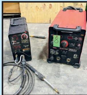
LINCOLN FLEXTEC 350 AND LN-25 SUITCASE WELDERS