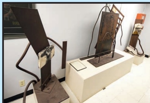
SCULPTURES FROM LOCAL ARTISTS