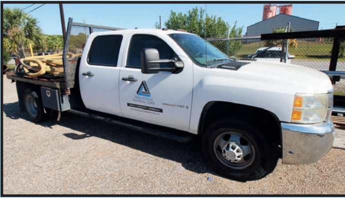
CHEVROLET DUALY FLATBED TRUCK