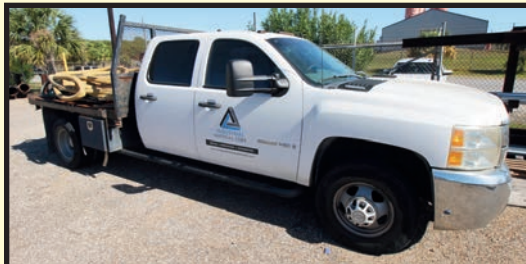
CHEVROLET DUALY FLATBED TRUCK

TUESDAY, DECEMBER 9 10:00 A.M. CT LIVE ONLINE WEBCAST (NO ONSITE BIDDING)