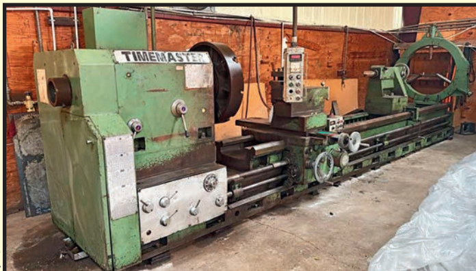
TIMEMASTER 51" X 200" ENGINE LATHE

Read Partial Terms and Conditions on Inside