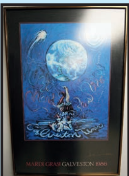
POSTERS AND OTHER FRAMED ARTWORK