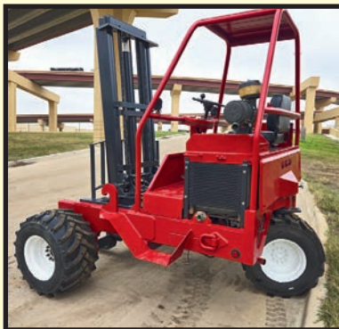
NAVIGATOR 5,500-LB. BASE CAP. MDL. RT5500 DIESEL FORKLIFT

HYSTER 8,000-LB. BASE CAP. MDL. S80FT , LPG engine, 84" 3-stage mast, 173" lift ht., side shift, cushion tires, S/N G004V02803E.