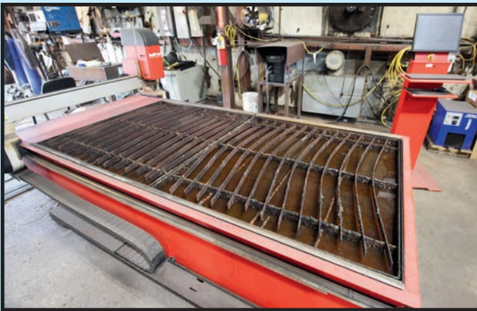
SWIFT-CUT PRO 4' X 8' CAP. CNC PLASMA CUTTING MACHINE