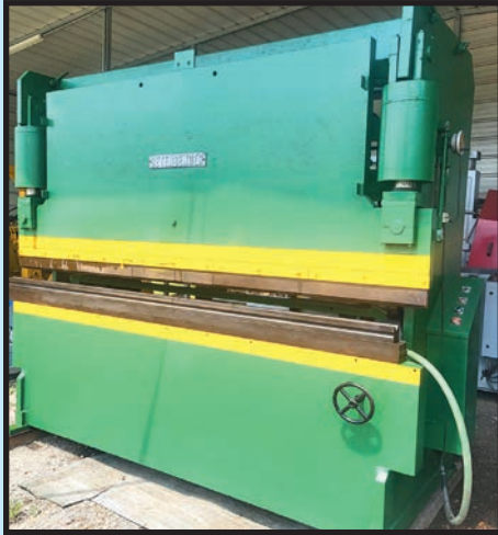
BETENBENDER 175 T. X 10' HYDRAULIC PRESSBRAKE