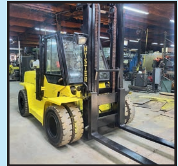
HYSTER 15,500-LB. BASE CAP. MDL. H155XL LPG FORKLIFT