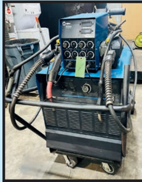
DELTAWELD 652 DUAL FEEDER WELDER