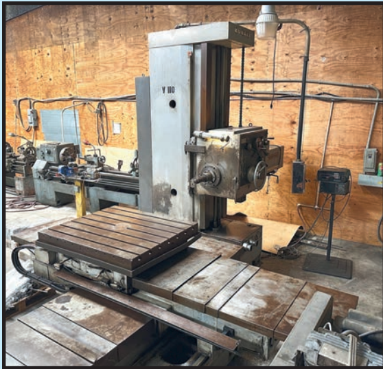
3.94" KURAKI HORIZONTAL BORING MILL

INSPECTION: By Appointment Only. Contact Vijay Patel at (713) 582-5978 to inspect.