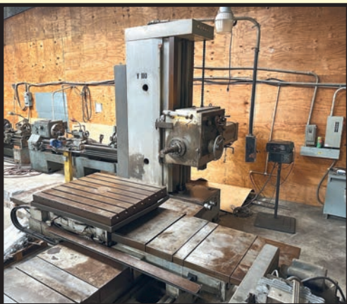
3.94" KURAKI HORIZONTAL BORING MILL