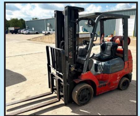
TOYOTA 5,000-LB. CAP. FORKLIFT

LIVE ONLINE BIDDING ONLY (NO ONSITE BIDDING): YOU MUST REGISTER IN ADVANCE FOR ONLINE BIDDING AT THIS AUCTION. Go to www.pmi-auction.com and click on BidSpotter or proxibid on our current auction page for this sale.