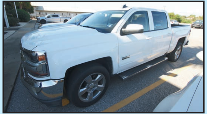
CHEVROLET CREW CAB PICKUP TRUCK