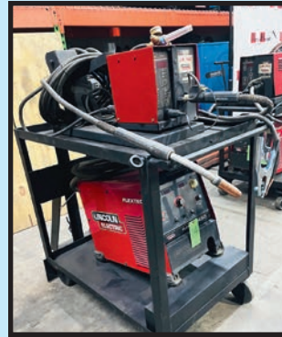
LINCOLN FLEXTEC 450 MIG WELDER