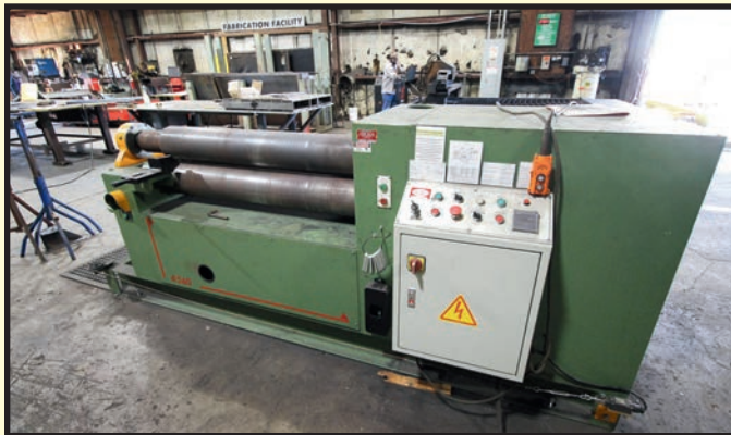
CHICAGO DRIES & KRUMP 50" X 9/16" BENDING ROLLS