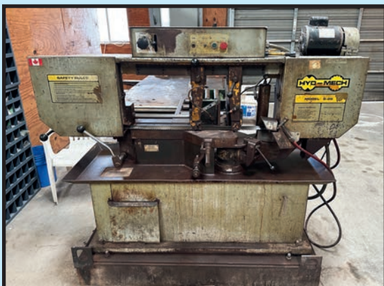
HYD-MECH 13" X 18" CAP. MDL. S-20 HORIZONTAL BANDSAW

INSPECTION: Varies by Location. See Each Location for Details.