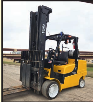
YALE 12,000-LB. BASE CAP. MDL. GLC120 LPG FORKLIFT