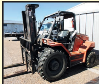
VIPER 8,000-LB. BASE CAP. ALL TERRAIN DIESEL FORKLIFT

INSPECTION: Varies by Location. See Each Location for Details.