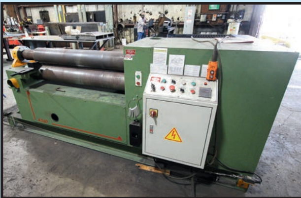
CHICAGO DRIES & KRUMP BENDING ROLLS