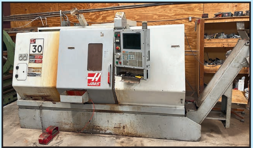
HAAS SL-30 T CNC LATHE

INSPECTION: Varies by Location. See Each Location for Details.