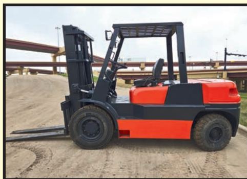
TAILIFT 11,000-LB. BASE CAP. MDL. FD50 DIESEL FORKLIFT