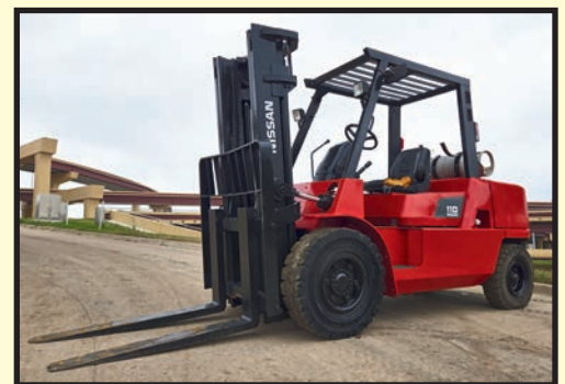
NISSAN 11,000-LB. BASE CAP. MDL. F04B50V LPG FORKLIFT