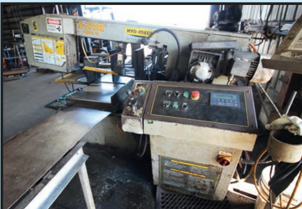
HYD-MECH 13" X 18" CAP. MDL. S-20A AUTOMATIC HORIZONTAL BANDSAW