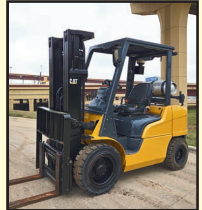
CATERPILLAR 6,000-LB. BASE CAP. MDL. 2P6000 LPG FORKLIFT

Friday, December 5 & Monday, December 8 from 9:00 A.M. to 4:00 P.M. Each Day. Call (817) 454-0759 for directions and appointment.