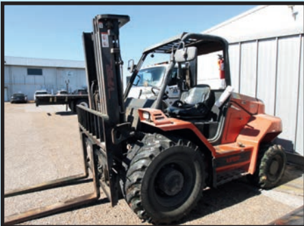
VIPER 8,000-LB. BASE CAP. ALL TERRAIN DIESEL FORKLIFT