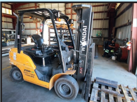
HYUNDAI 5,000-LB. BASE CAP. DIESEL FORKLIFT