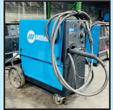
MILLERMATIC 251 MIG WELDER