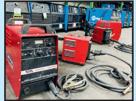
LINCOLN V-300 AND FEEDER MIG WELDERS

INSPECTION: Friday, December 5 & Monday, December 8 from 9:00 A.M. to 3:00 P.M. Each Day, or By Appointment Call (404) 736-6494.