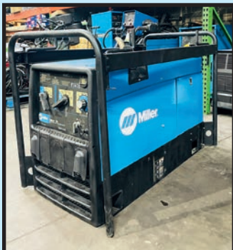
MILLER BOBCAT 250