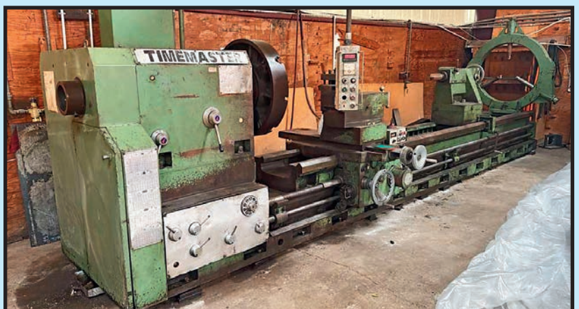
TIMEMASTER 51" X 200" ENGINE LATHE