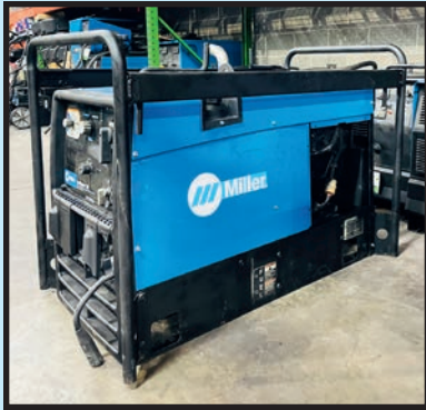
MILLER TRAILBLAZER 302