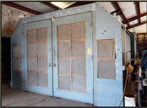
JBI MDL. A30-513 PAINT BOOTH 30'L. X 15'W.