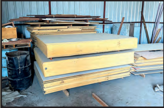
SAMPLE VIEW OF MDF AND PARTICLE BOARD