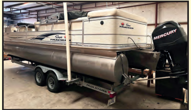
SUN TRACKER 2008 REGENCY EDITION PONTOON BOAT

Mfg. 1974, VIN 7T47614001, License Y53-231, 11,000-lb. weight, 53'L., w/contents, aluminum and plastic extrusion.