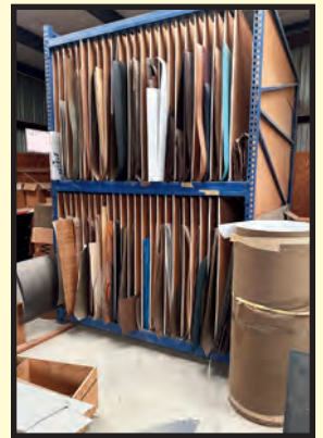
TEAR DROP LAMINATE STORAGE UNIT