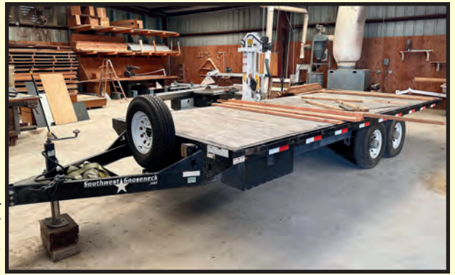
SOUTHWEST GOOSENECK UTILITY TRAILER, 20' BUMPER PULL