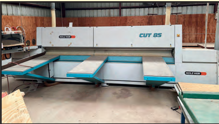
HOLZ-HER MDL. CUT 85 AUTOMATIC PANEL SAW

J & H MANUFACTURING, INC. 161 CR 777, DEVINE, TEXAS 78016