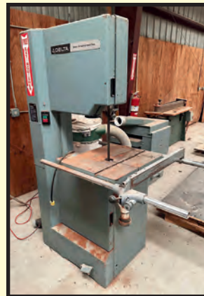
DELTA MDL. 20 VERTICAL BANDSAW