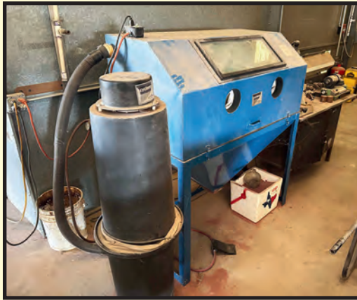
CYCLONE BLAST CABINET