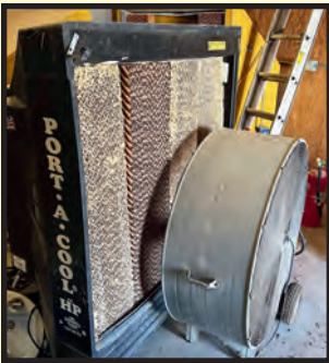
PORT-A-COOL MDL. PAC2K36HPVS, 36" COOLER