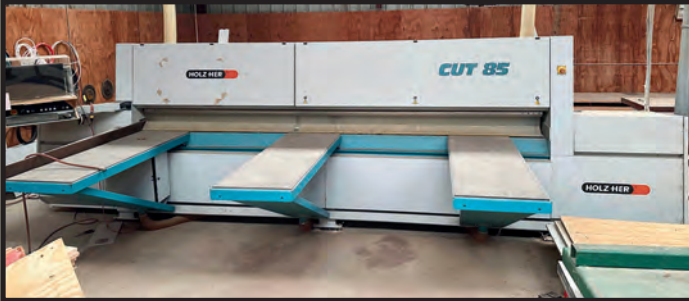
HOLZ-HER MDL. CUT 85 AUTOMATIC PANEL SAW