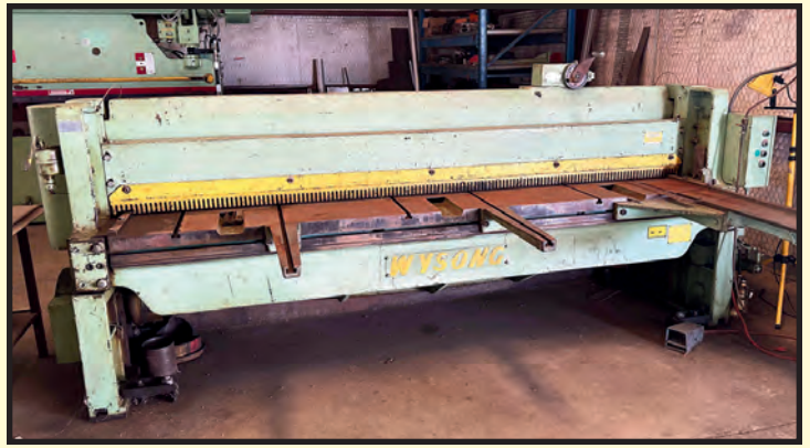
WYSONG MDL. 1010-RD POWER SQUARING SHEAR