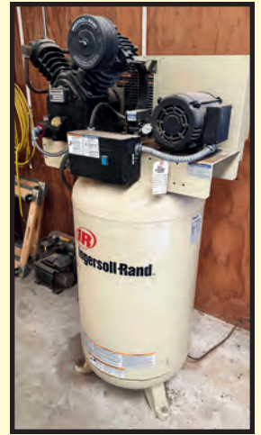
INGERSOLL RAND MDL. 2475 AIR COMPRESSOR