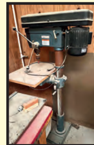
WILTON MDL. 2550 DRILL PRESS