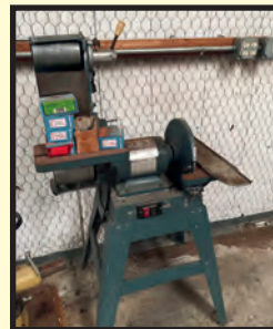
JET MDL. JSG-6 DISK/BELT SANDER