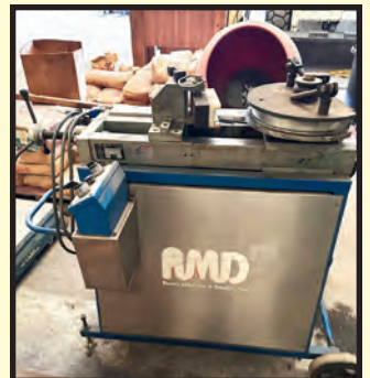
RMD MDL. 300S-220 PIPE BENDER

THURSDAY, APRIL 9 – TIMED ONLINE ONLY AUCTION NO ONSITE BIDDING – BIDS START CLOSING AT 10:00 A.M. CDT