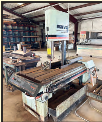
MARVEL SERIES 8 MARK II TILT FRAME VERTICAL BANDSAW