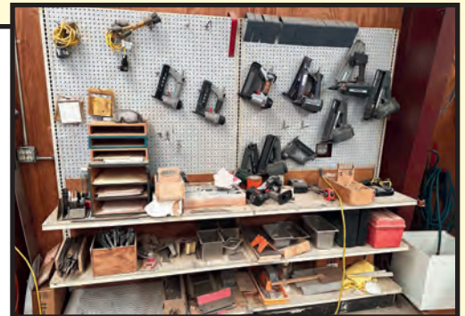
SAMPLE VIEW OF WOODWORKING TOOLS