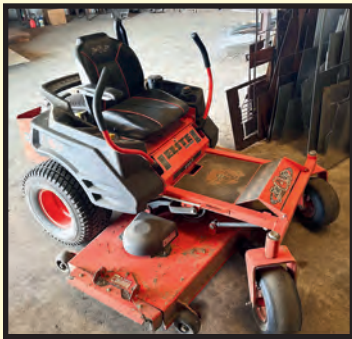
BAD BOY ELITE SERIES ZERO TURN MOWER

TIMED ONLINE ONLY AUCTION NO ONSITE BIDDING