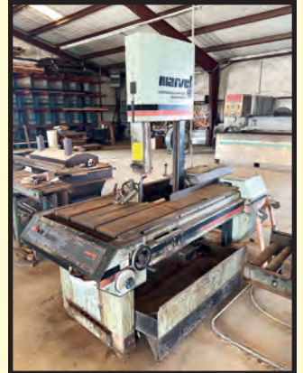
MARVEL SERIES 8 MARK II TILT FRAME VERTICAL BANDSAW