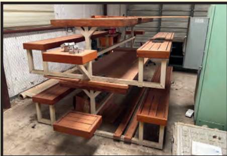
J & H MANUFACTURED PICNIC TABLES

6-tier, 48" arms, approx. 24'L. x approx.16'H. x 64"D. base (Note: contents not included) (two-week delayed removal).