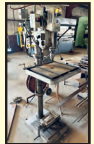
CLAUSING ARBOGA DRILL PRESS