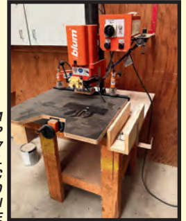
BLUM MINIPRESS P MDL. 2007 VERTICAL PNEUMATIC BORING AND INSERTION MACHINE