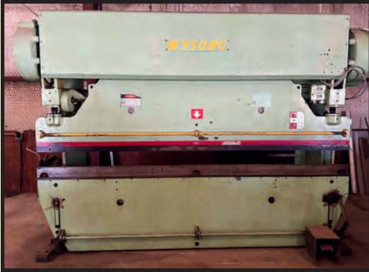
WYSONG MDL. 90-10 MECHANICAL PRESS BRAKE