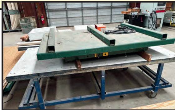
JOYCE 6,000-LB CAP. SCISSOR LIFT AND ROLLING TABLE