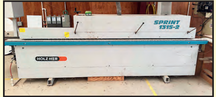
HOLZ-HER MDL. SPRINT 1315-2 EDGE BANDER