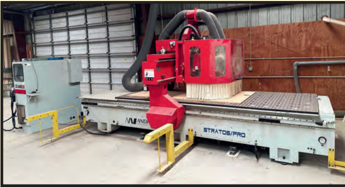
ANDI ANDERSON GROUP-STRATOS/PRO 5' X 12' CAP. CNC ROUTER