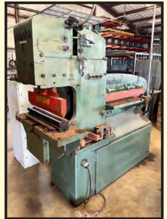
PIRANHA II HYDRAULIC IRONWORKER