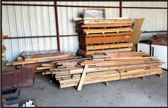
VIEW OF PLYWOOD, MDF AND PARTICLE BOARD