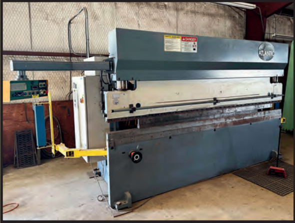
ATLANTIC 150 T. X 12' MDL. HDE-150-12 CNC HYDRAULIC PRESS BRAKE

Featuring: Fabricating Machines; Woodworking Machines; Metal & Wood Raw Material; Forklift, Pickup Truck; Trailers; Pontoon Boat; MORE!