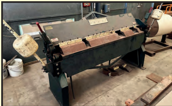
NATIONAL MDL. 116-7212 FINGER BRAKE