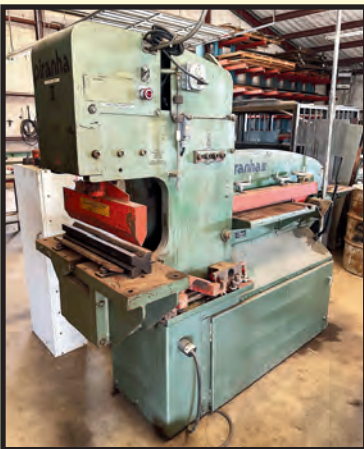
PIRANHA II HYDRAULIC IRONWORKER