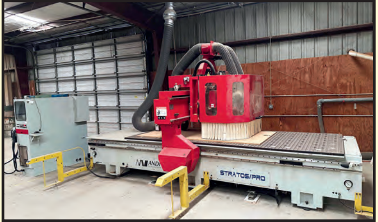
ANDI ANDERSON GROUP-STRATOS/PRO 5' X 12' CAP. CNC ROUTER