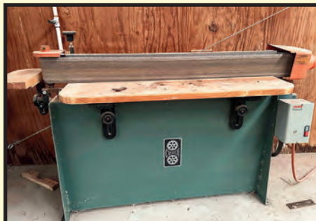
CROUCH MDL. 205 BELT SANDER