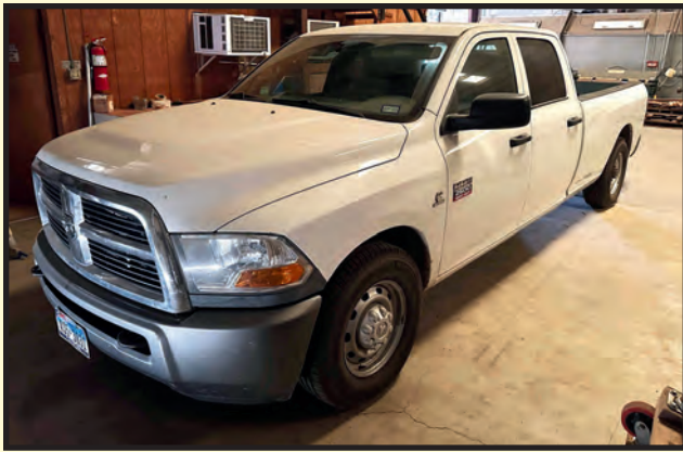
2009 DODGE RAM 2500 PICK UP TRUCK, CUMMINS DIESEL ENGINE