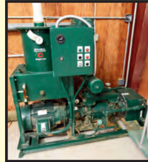
DYNASEAL VACUUM SYSTEM