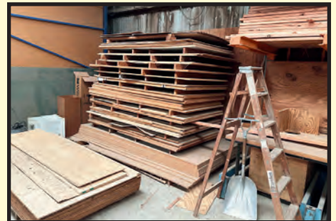
SAMPLE VIEW OF RAW MATERIAL