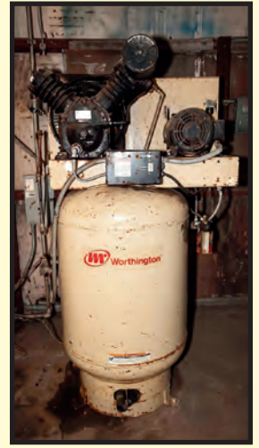
INGERSOLL RAND MDL. T30 AIR COMPRESSOR