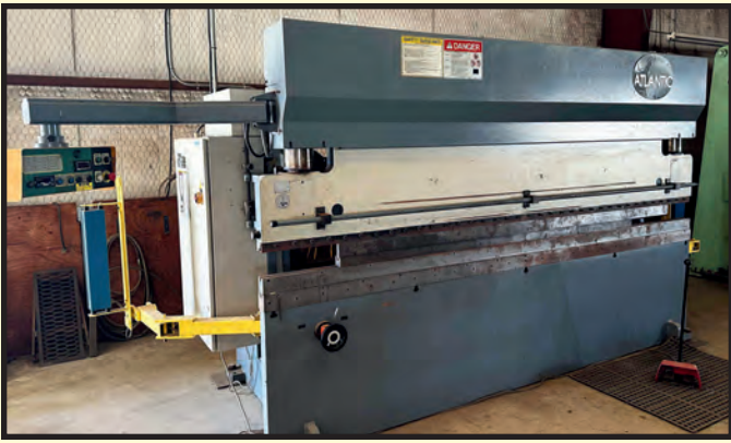
ATLANTIC 150 T. X 12' MDL. HDE-150-12 CNC HYDRAULIC PRESS BRAKE