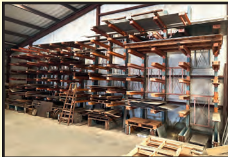
IN PROCESS MATERIAL, STEEL PLATE, BAR, ALUMINUM AND STEEL SHEET