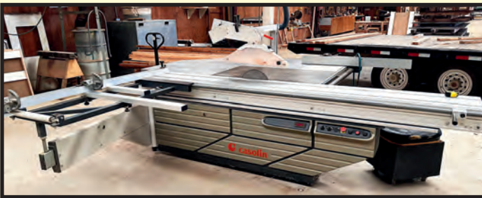
CASOLIN MDL. ASTRA DGT T.1 SLIDING TABLE SAW