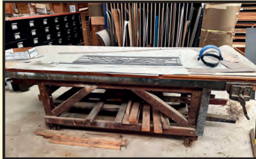
HEAVY DUTY WORK TABLES