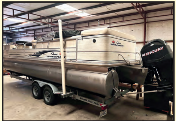
SUN TRACKER 2008 REGENCY EDITION PONTOON BOAT