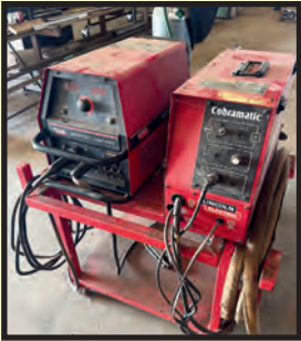
LINCOLN INVERTEC V350 PRO WELDER

MDL. MT, Mfg. 2012, 1,200-lb. lift cap., 150-lb. lift cap./pad.