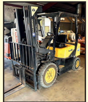
DAEWOO MDL. G25S-3 4,050-LB. BASE CAP. FORKLIFT