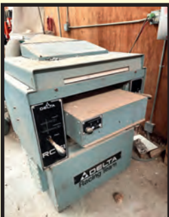
DELTA MDL. RC51 PLANER