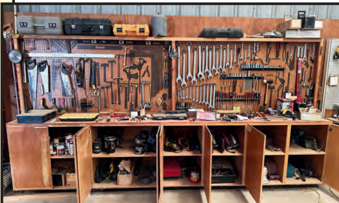
SAMPLE VIEW OF LARGE QUANTITY HAND TOOLS

HUGE OFFERING OF WOODWORKING AND METAL WORKING POWER AND HAND TOOLS! SEE CATALOG FOR DETAILS.