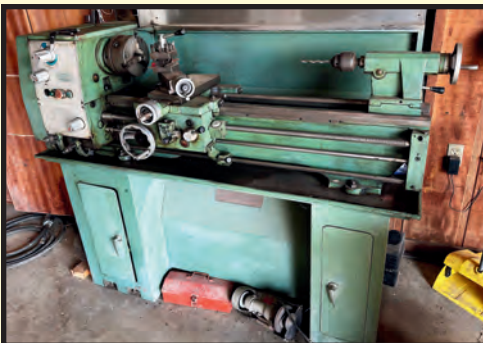
ANDES MDL. 16CSG TOOL ROOM LATHE

INSPECTION: Tues. & Wed., April 7 & 8, 9:00 A.M. to 4:00 P.M. Daily