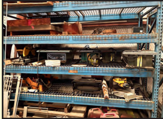
SAMPLE VIEW OF RACK SECTIONS