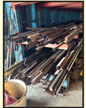
SAMPLE VIEW OF RAW MATERIAL