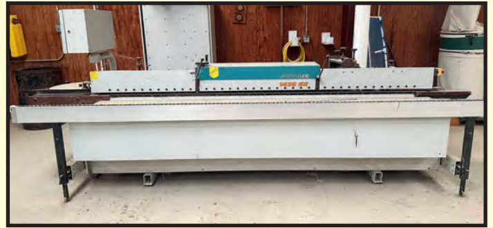
HOLZ-HER MDL. PRIMUS 1436 SE EDGE BANDER