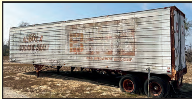
UTILITY VAN BOX TRAILER