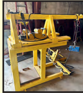
POWER GRIP VACUUM LIFTER MDL. MT