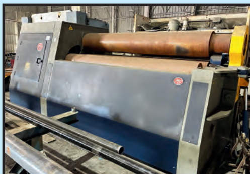
MG 102" X 1.57" PLATE ROLL