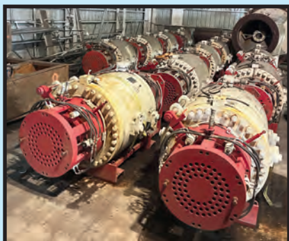
(14) DLT STRAND JACKS

UNIQUE OFFERING OF FABRICATING EQUIPMENT, OILFIELD COMPONENTS, INDUSTRIAL PROCESSING EQUIPMENT, HEAVY DUTY RIGGING EQUIPMENT, M.R.O.; DON'T MISS IT!