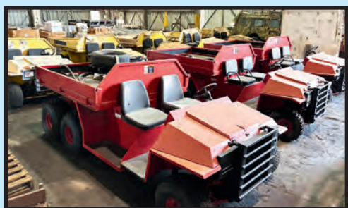
HYVEE DIESEL VEHICLES

Read Partial Terms and Conditions on Back Page of Brochure