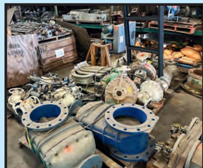
SAMPLE VIEW OF VALVES

Surplus to the Ongoing Operations of RIVERWAY GROUP, LLC EQUIPMENT STORED IN BAY LTD. BLDG. 12221 ALMEDA ROAD, HOUSTON, TEXAS 77045