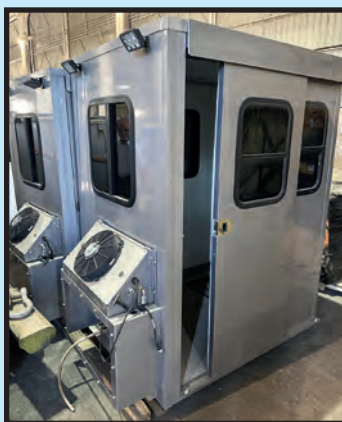
OPERATOR'S BOOTHS WITH A/C