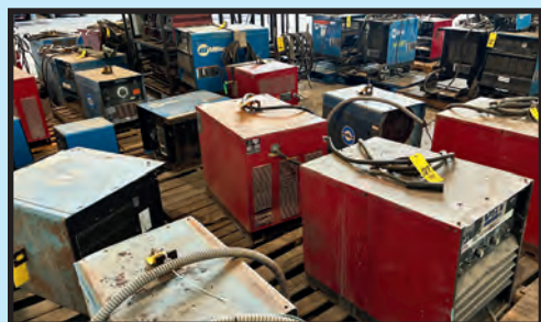
LARGE QUANTITY WELDERS

WEDNESDAY, JULY 8 10:00 A.M. CDT LIVE WEBCAST (NO ONSITE BIDDING)