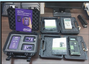
UVA LIGHT METERS