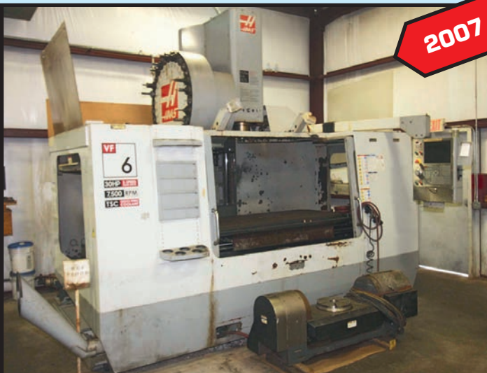
HAAS MDL. VF6/50 5-AXIS VERT. MACHINING CENTER

WIDE SELECTION OF 8" AND 6" KURT VISES; JERGENS QUICK CHANGE CLAMP WORK HOLDING SYSTEMS; CUSTOM TOMBSTONE; FIXTURING; SERRATED JAW VISES; CAT 50 AND CAT 40 TOOL HOLDERS; COLLETS; LIVE AND DEAD CENTERS; BORING BARS; TURNING TOOLS; CONSUMABLES; CARBIDE INSERTS; MORE!