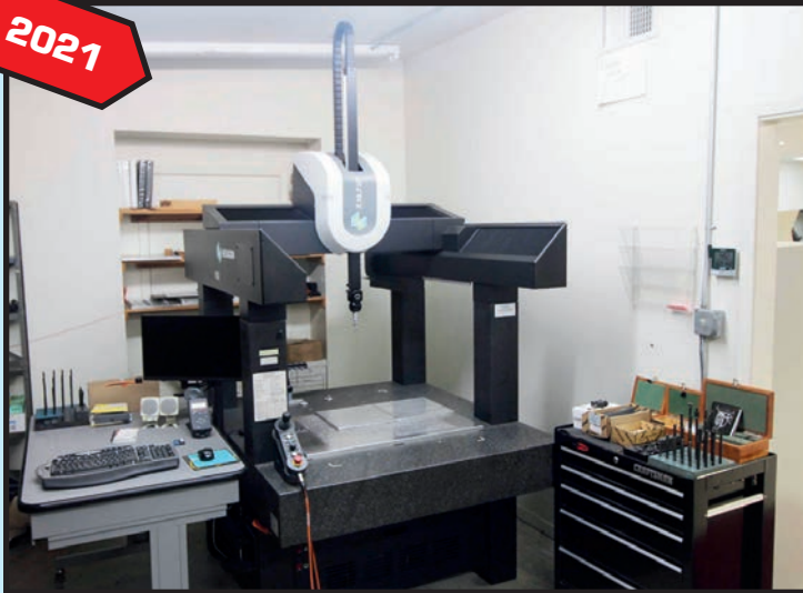
HEXAGON METROLOGY BROWN & SHARPE CMM