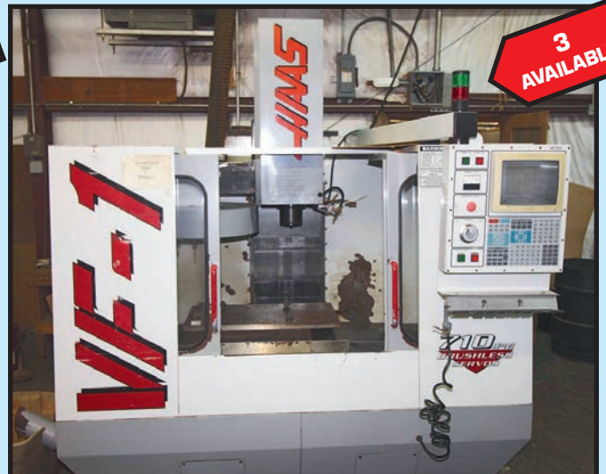
(1 OF 3) HAAS MDL. VF-1 VERT. MACHINING CENTERS