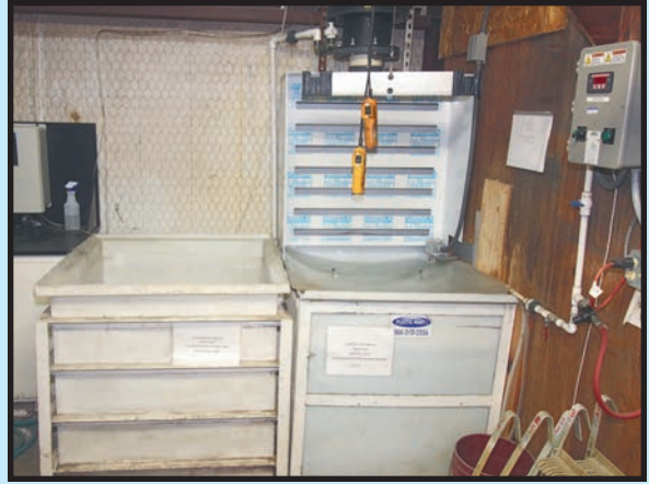
PRE-PENETRANT ETCH LINE