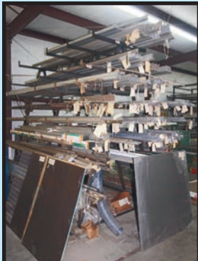
SAMPLE VIEW OF RAW MATERIAL