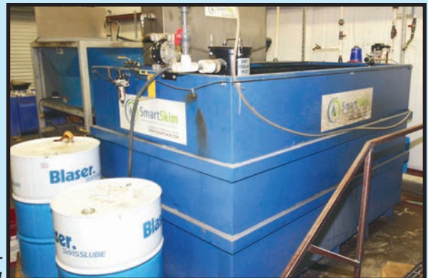
SMART SKIM COOLANT RECYCLING SYSTEM

INSPECTION: Monday & Tuesday, February 6 & 7, 9:00 A.M. to 4:00 P.M.