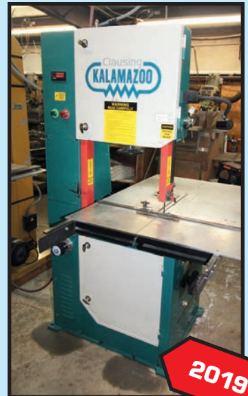
CLAUSING KALAMAZOO MDL. V2012F VERT. BANDSAW