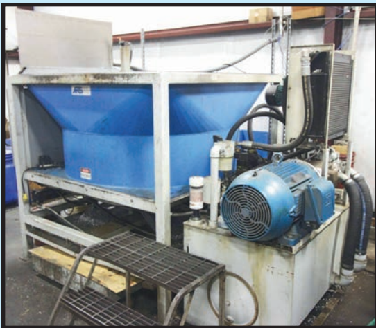
APPLIED RECOVERY SYSTEMS METAL BRIQUETTER