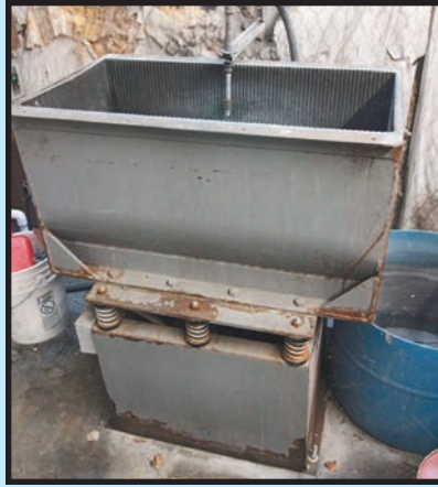
MR. DEBURR VIBRATORY DEBURRING MACHINE