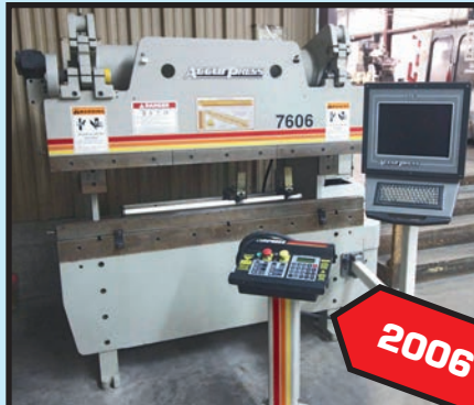
ACCURPRESS 60 T. X 6' MDL. 7606 HYD. PRESSBRAKE