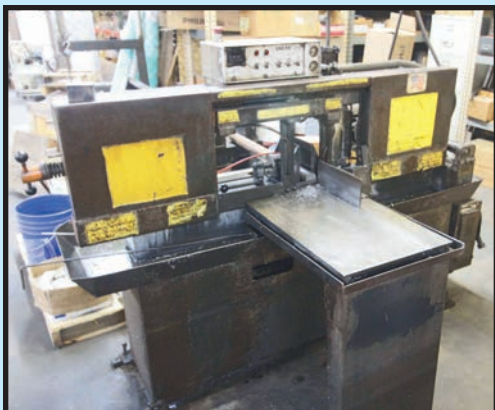
HEM MDL. H-75A AUTO. HORZ. BANDSAW

CLAUSING KALAMAZOO MDL. V2012F, new 2019, 20" x 12" cap., 20" throat depth, 12" ht. cap., S/N M1960316; POWERMATIC MDL. PM1800B, 18" cap., 5 HP, S/N 18030016, WELLSAW MDL. V-20, S/N 2422.