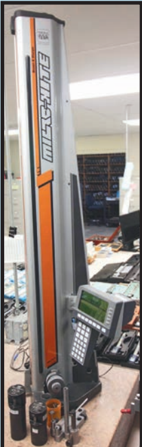
BROWN & SHARPE MDL. MICRO-HITE 900 DIGITAL HEIGHT GAUGE

WED., FEB. 8 10:00 A.M. LIVE ONLINE WEBCAST (NO ONSITE BIDDING)