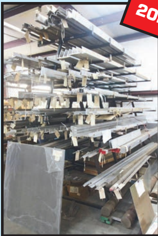
SAMPLE VIEW OF RAW MATERIAL