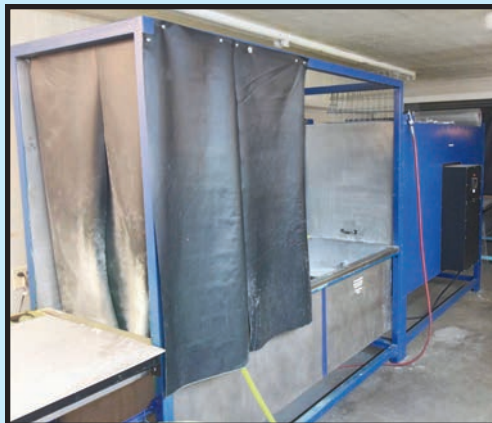
LIQUID PENETRANT INSPECTION LINE