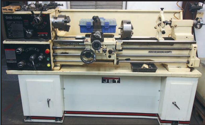
13" X 40" JET MDL. GHB-1340A ENGINE LATHE

DIGITAL OD CALIPERS; BORE GAUGES; ID GAUGES; SUNNEN PRECISION SMALL BORE GAUGE, Mdl. PG-710-E; SUNNEN GAUGE SETTING FIXTURES, Mdl. PG-810-Z08X, Mdl. PG-800-E, Mdl. PG-500-U100X; FOWLER HEIGHT GAUGES; PIN GAUGES; DIAL CALIPERS; GRANITE SURFACE PLATES; CENTURION NDT REFERENCE CONDUCTIVITY STANDARD W/DIGITAL DISPLAY; US SOLID ANALYTICAL BALANCE SCALE; LISTA BENCH CABINET; PORTABLE REFRACTOMETER; 123 BLOCKS; PLUG AND RING GAUGES; DEPTH GAUGES; MORE!