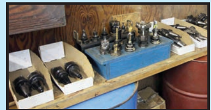
SAMPLE VIEW OF TOOLING