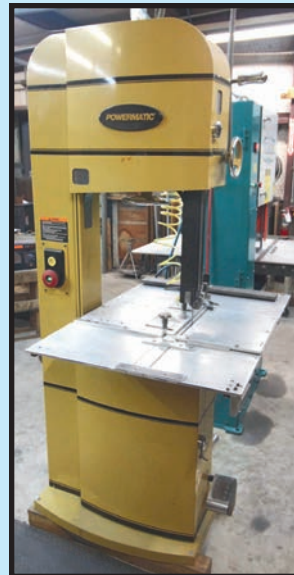
POWERMATIC MDL. PM1800B VERT. BANDSAW