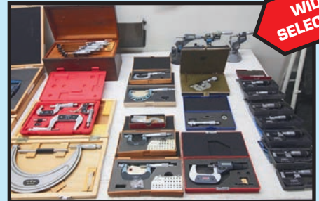
SAMPLE VIEW OF Q.C. AND MEASURING EQUIPMENT