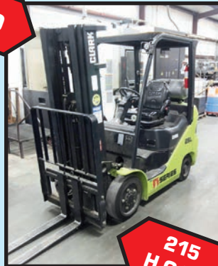
CLARK 5,000-LB. BASE CAP. FORKLIFT