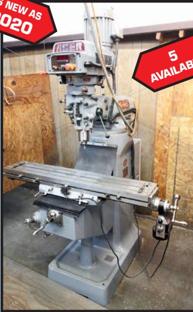
(1 OF 5) ACER E-MILL MDL. 3VSII VERT. TURRET MILLS