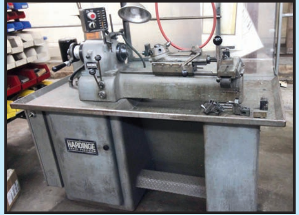
HARDINGE MDL. DV-59/D9M-59 PRECISION LATHE