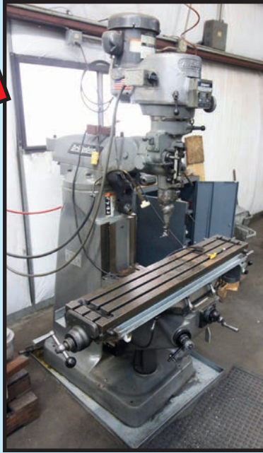
BRIDGEPORT MDL. SERIES I VERT. TURRET MILL