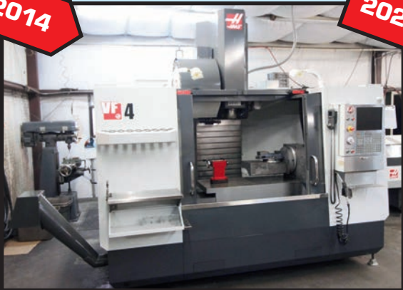
HAAS MDL VF-4 5-AXIS VERT. MACHINING CENTER