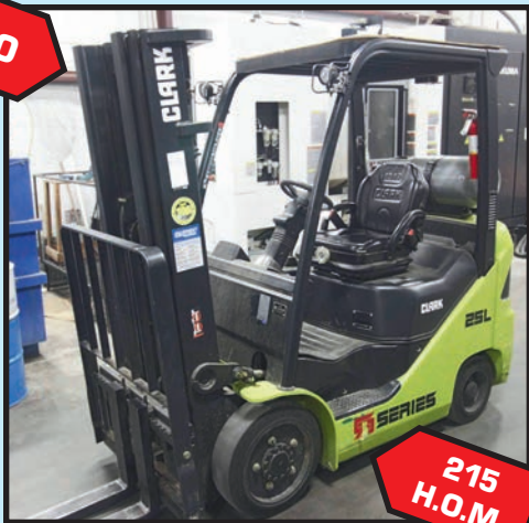
CLARK 5,000-LB. BASE CAP. FORKLIFT