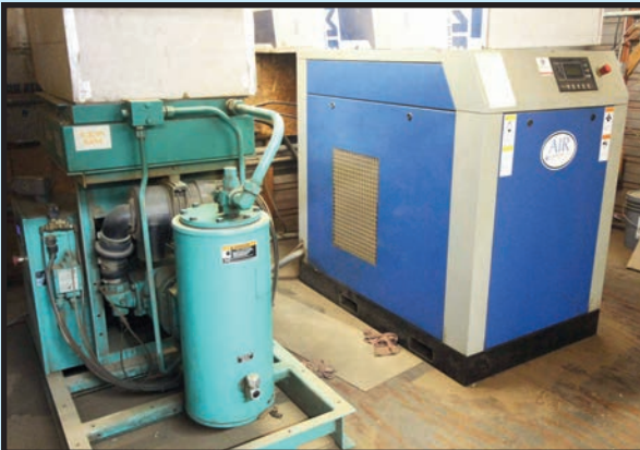
50 HP AND 40 HP ROTARY SCREW AIR COMPRESSORS