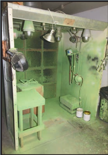
PAASCHE MDL FABF-8 PAINT BOOTH