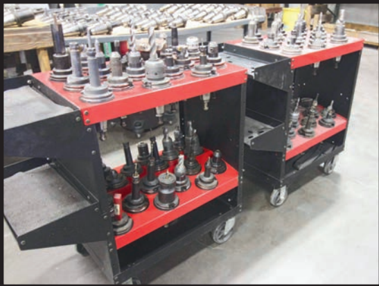
LARGE SELECTION OF CARTS AND TOOLING