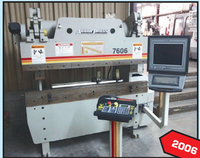
ACCURPRESS 60 T. X 6' MDL. 7606 HYD. PRESSBRAKE