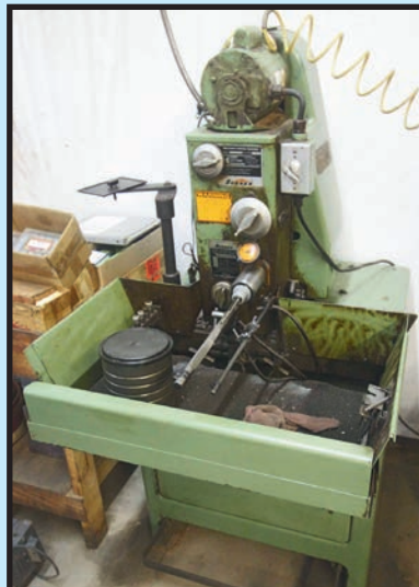
SUNNEN MDL. 1660 PRECISION HONE