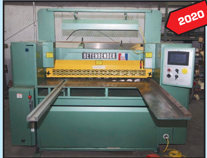
BENTENBENDER 10 GAUGE X 4' MDL. 4-10GA HYD. SHEAR