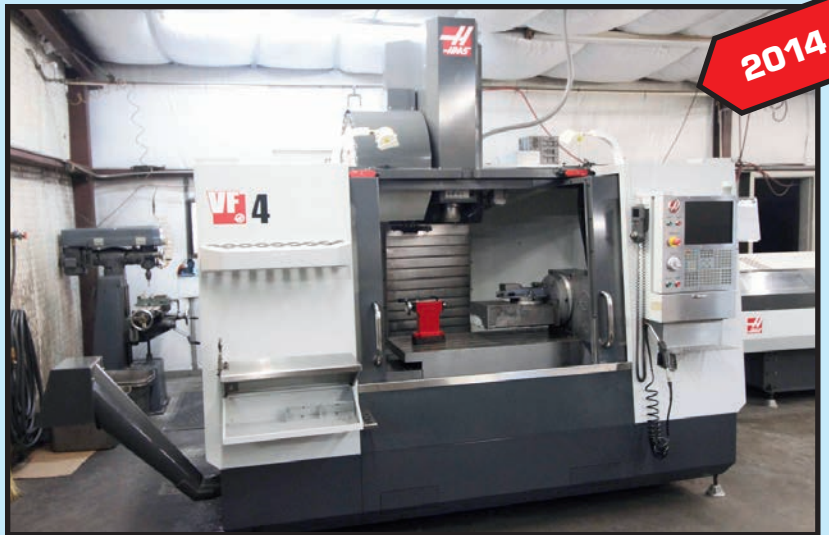
HAAS MDL. VF-4 5-AXIS VERT. MACHINING CENTER