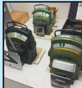
SUNNEN PRECISION SMALL BORE GAUGES