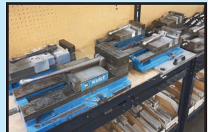
SAMPLE VIEW OF VISES