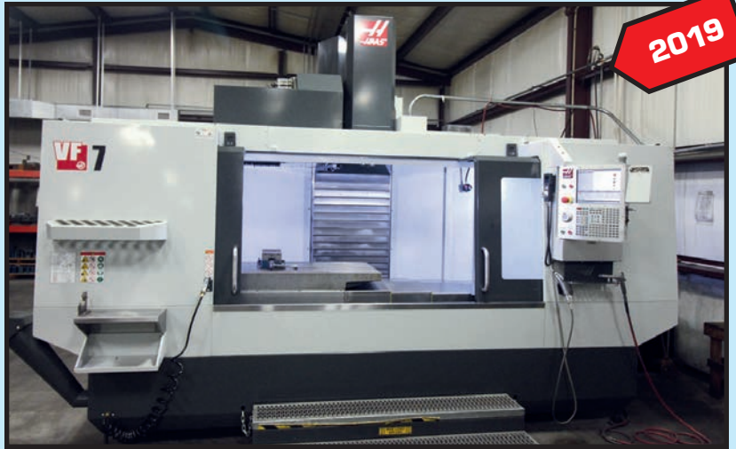
HAAS MDL. VF7/40 3-AXIS VERT. MACHINING CENTER

HAAS MDL. VF7/40 , new 2019, 84" x 28" tbl. size, 84" X, 32" Y, 30" Z-axis travels, CAT 40, 30 HP, 7,500 RPM, 30-pos. ATC, Renishaw probe system, S/N 1164561.