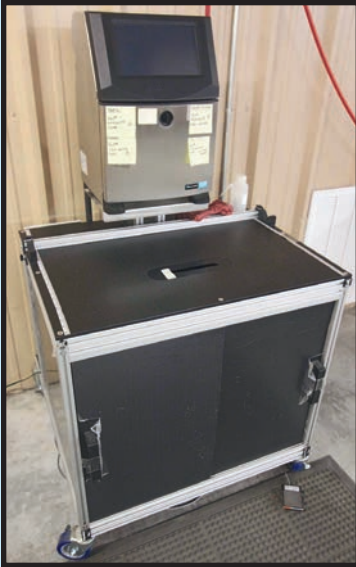
VIDEOJET MDL 1580 INKJET CODER