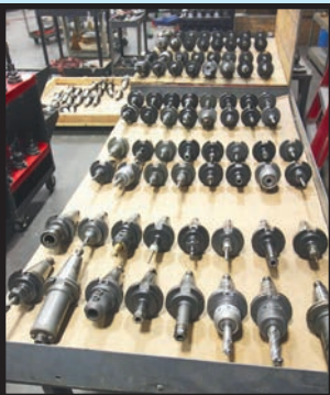
SAMPLE VIEW OF TOOL HOLDERS

WED., FEB. 8 10:00 A.M. LIVE ONLINE WEBCAST (NO ONSITE BIDDING)