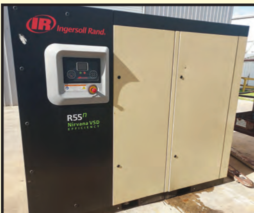
INGERSOLL RAND NIRVANA R55N-A 100 HP ROTARY SCREW AIR COMPRESSOR