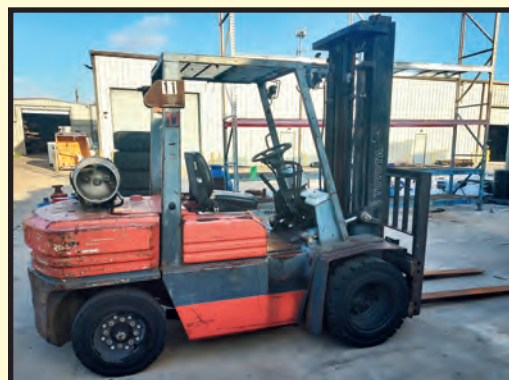
TOYOTA 8,000-LB. BASE CAP. MDL. 02-5FG35 LPG FORKLIFT