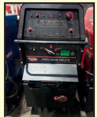
LINCOLN PRECISION TIG 275