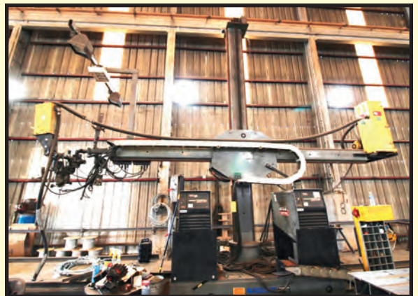
PRESTON EASTIN 12' X 12' CAP. WELDING MANIPULATOR

Read Partial Terms & Conditions on Page 6