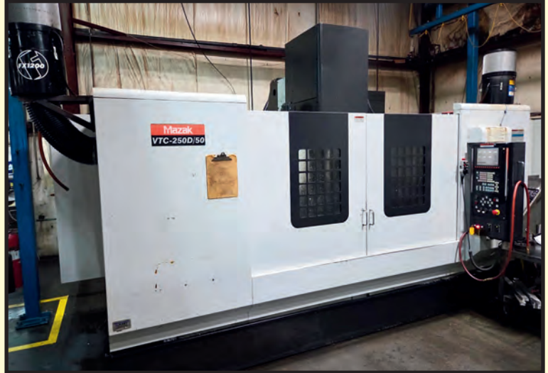
MAZAK VTC-250D/50 VERTICAL MACHINING CENTER

THURSDAY, JUNE 25 AT 10:00 A.M. CDT LIVE ONLINE WEBCAST (NO ONSITE BIDDING)