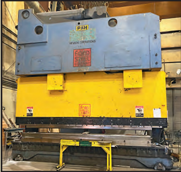
ALLSTEEL 1,000 T. CAP. HYDRAULIC PRESS BRAKE

LARGE CAP. 1.38" X 118" PLATE ROLL; 1,000 T. X 16' PRESS BRAKE; (10) MANIPULATORS; FIT-UP LINE; TANK TURNING ROLLS; UNUSED 50 KW DIESEL GENERATOR; UNUSED HELIPORT/AIRPORT LIGHTING PACKAGE; MORE!